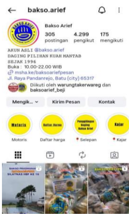
Figure 2. Bakso Arief Instagram

In terms of digital marketing, the partner’s Instagram account, which previously had only 200 followers, has grown to 1,250 followers within three months, with an average engagement rate of 7.8%. In addition, positive reviews on Google Maps increased from 15 to 63 reviews over the same period, with the majority of tourists highlighting the interactive experience as a key strength.