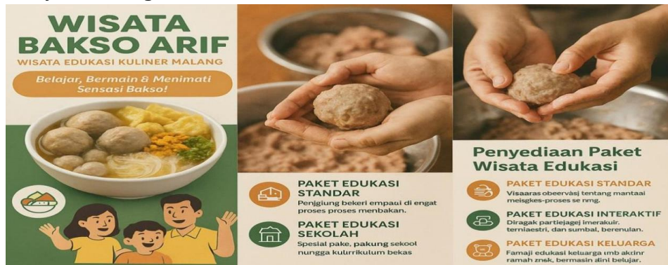
Figure 1. Bakso Arif package tour brochure

Overall, these findings show that the integration of culinary and educational tourism not only differentiates the product but also contributes to long-term competitiveness, economic growth, and community well-being in Batu.