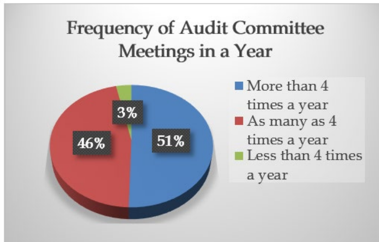
Figur 2. Frequency of Audit Committee Meetings in a Year