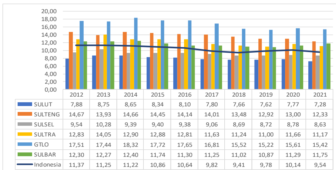
Figure 1. Provincial Poverty in the Sulawesi Regional Region 2012-2021

The following is a description of provincial poverty in the Sulawesi regional area for the 2012-2021 period: