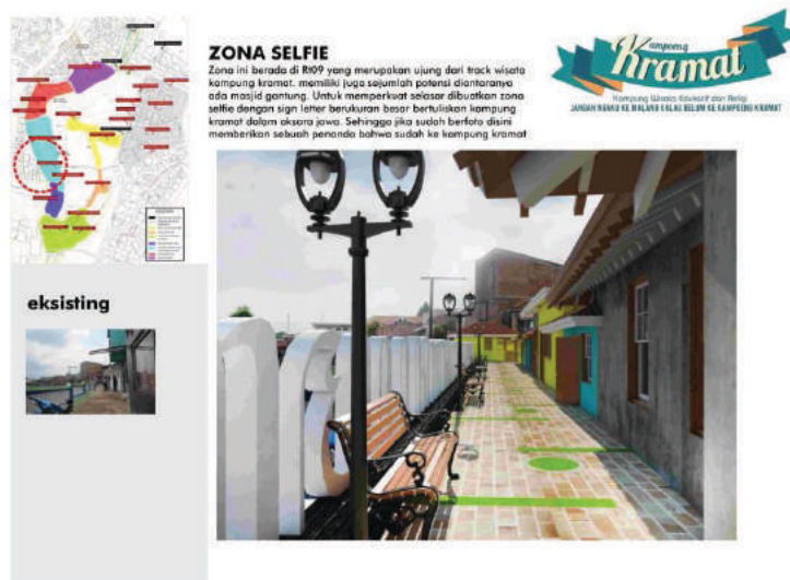
Fig. 17. Selfie Zone.

Selfie zone with supersized letter as a photographic background.