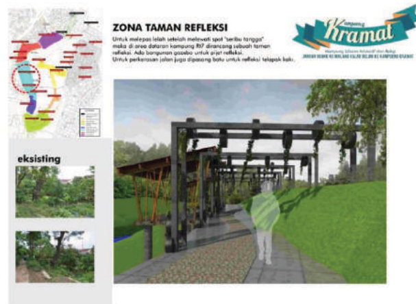
Fig. 14. Massaging Zone.