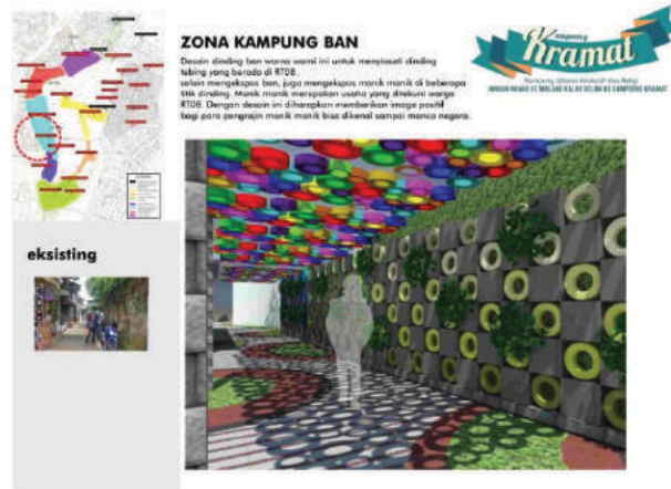
Fig. 16. Kampung ban Zone.