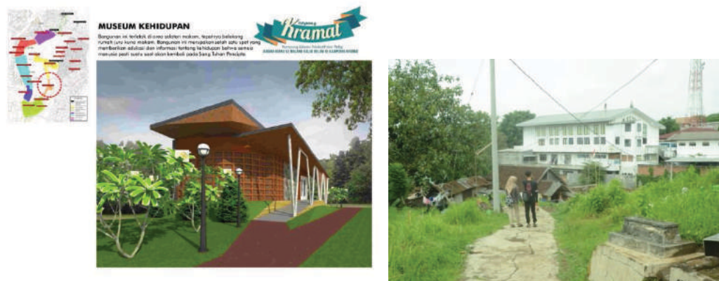
Fig. 7. Museum Kehidupan.

This building is located in the area south of, precisely the back of the key. tomb This building is one spot that give education and information about of life that everyone will someday return to the creator of. Ena having a wider area.