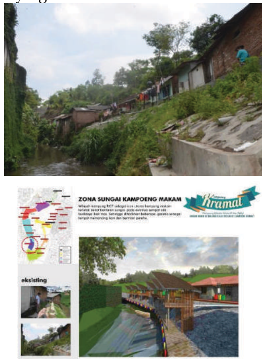
Fig. 11. Gazebo in Fishing zone. (source: personal files, 2016)

Kampung RT 07 has main icon is tomb. It located near the river bank. At first had showing carp. So that presented some gazebo sited as a fishing place and playing boat.