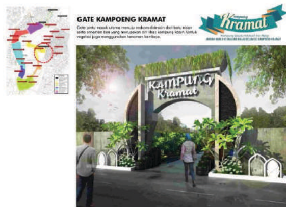
Fig. 4. Main gate.

Is the main entrance to the designed of stone And ornament a tire are characteristic their Kasin .To vegetation also use of cambodia.