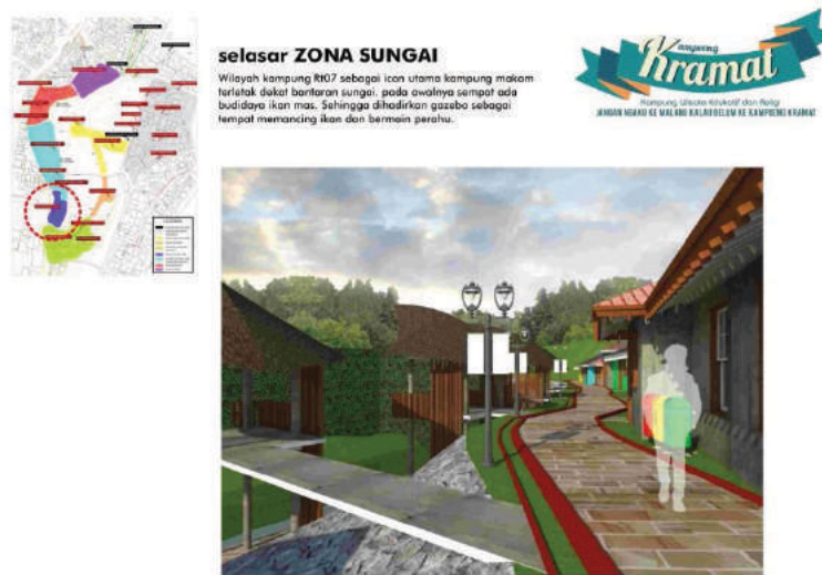
Fig. 12. Gazebo and Fishing zone.