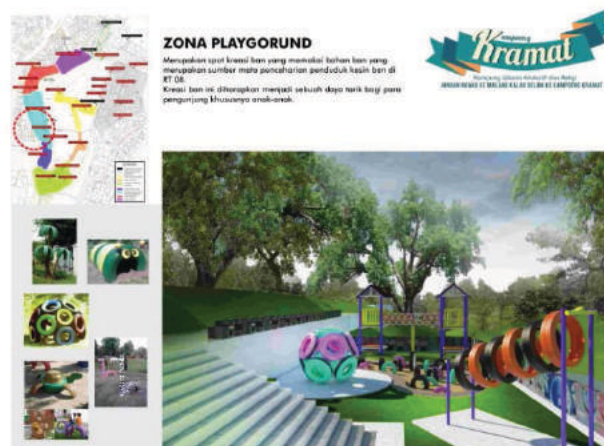
Fig. 15. Playground.

Creation this tire are expected to become a attraction for visitors especially children.