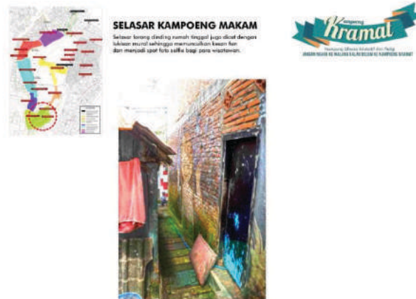
Fig. 10. Wall Corridor