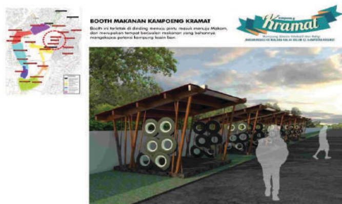
Fig. 5. Culinary Booth .

Booth is located on the wall entrance, there are selling food and Exposing Kampung Kasin.