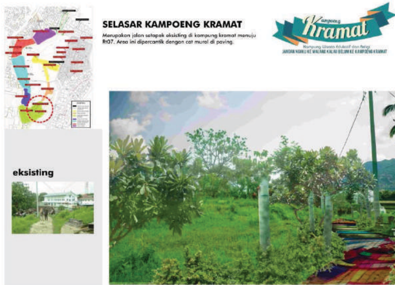
Fig. 8. The Corridor.