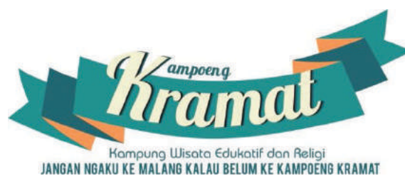
Fig. 2. Design Logo Kampung Kramat Kasin

Brand name Kramat taken also from the name of this village in. So the name has the potential image strong able to tell their identity. The icon has a religious meaning. Kramat means tour and religious educative things. So apart religious tourism has the potential meaning, but there were also has potential education tourism. Through this tourism, it able to give life guidance and improve the relationship with God.