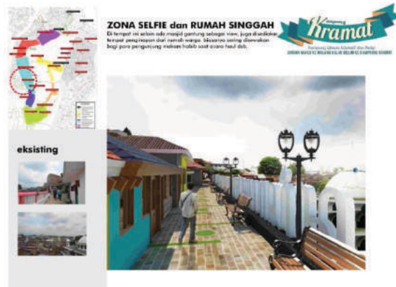
Fig. 18. Shelter House Zone

Design Kampung Kramat Kasin of their religious tourism and education is expected to realized in accordance guideline in realizing design the results of competition this. So that their benefits can be perceived for the city residents malang and residents RW 03 especially. To design this concept can still developed more detailed per the area, good infrasturktur, infrastructure pattern building occupancy house the side of a river in RT 07.