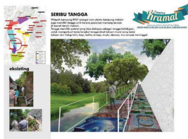
Fig. 13. A Thousand Stairs.

The Kampung RT07 has unique households located below cemetery land. Households have the potentiality to be exposed, as a stair, life to strengthen the theme households painted on murals. It is containing a painting of born, baby, toddlers, teenagers, young, adult, old died.