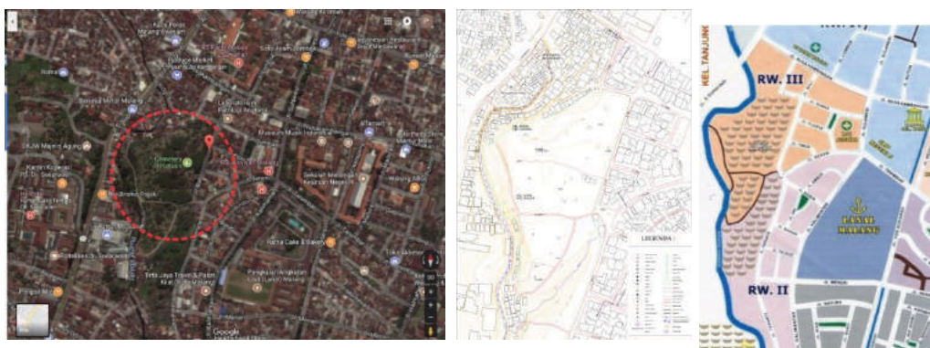
Fig. 1. Map of Kelurahan Kasin, Made of various sources, 2017

This paper is trying to dissect in depth of design one of the competition their thematic, 2016 namely Kampung Kramat Kasin located in RW 03 Kelurahan Kasin, in Klojen Malang City. In general this village was in the area of common Kasin, inhabited by about 150 families with the total number of 450 people. Scope the area is designed Neighborhood 07 (RT 07), Neighborhood 08 (RT 08), and Neighborhood (RT 09). All has the potential and weakness. RT 07 having the local annual ceremonies, besides RT 07 have potentials social and cultural life and the position tread under cemetery land, then RT08 having the same craft the economic potential, souvenir and good, and RT09 having the culinary things. Land status is municipal so to progress on the supervision of a government Malang City.