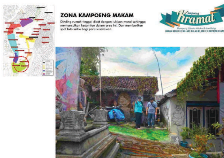
Fig. 9. Mural Wall.

The houses painted with painting murals to the point where the impression fun in this area. And giving spot photo selfie for tourists