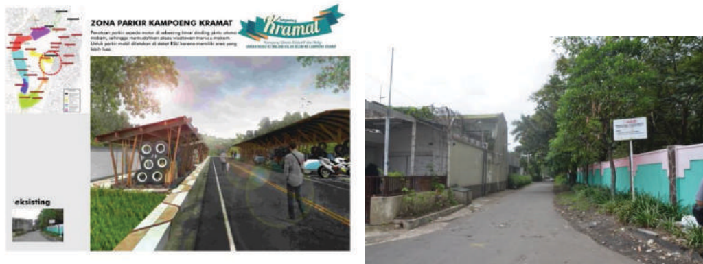
Fig. 6. Parking Area.

The motorcycle parking is across eastern walls of main entrance. That allow access to the park placed near public hospitals.