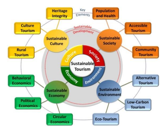
Fig.1. Four Conceptual aspects required for achieving sustainable tourism Sources: Buckley, 2011

Sustainable, attractive, and politically suitable tourism should be established to be recognized globally. Activities that promote sustainable tourism primarily address the economic, social, cultural, and environmental elements of development (Shu Yuan et al., 2018). The idea behind these four components of tourist sustainability, tourism operations occasionally negatively affect the environment, ecosystems, economy, society, and culture since natural resources may be intensively exploited in the tourism industry. Potential environmental effects can range from regional disturbance in endangered plant and animal species to worldwide ocean pollution in protected regions (Buckley, 2011). To ensure the short and long-term development of sustainability for the tourism sector in the face of climate change, a balanced balance among these four elements should be taken into account.