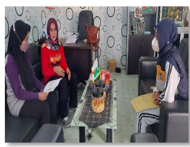
Figure 2 . Interview with a Nutritionist at the Turen District Health Center Figure 3 . Interview with the Head of Sananrejo Village and the Midwife of Sananrejo Village, Turen District

Researchers used primary data through interviews with the Malang District Health Office, Turen District Health Center, Sananrejo Village Head and Sananrejo Village Midwife Turen District. The results of the interview of the Stunting researcher in Sasanrejo Village in 2021 according to the informant in the researcher's interview, there were 109 people in 2022, while in 2022, the stunting data in Sananrejo Village decreased by 99 people. In June 2022 last month, according to the informant from the Sananrejo Village Midwife, Turen Sub-district, the number of stunting in Sananrejo village decreased again to 84 people. The results of interviews with researchers, all informants stated that the decline in stunting in the village was the main factor that the people liked to eat fish. Fish as a food source, fish has excellent nutritional content, protein as a source of growth, omega 3 fatty acids which are beneficial for maternal health and fetal brain formation, vitamins, and various minerals that are very beneficial for the mother and fetus.