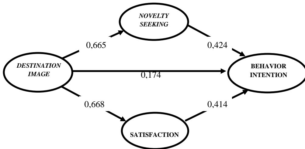
Figure 2 Path Analysis

The mediation relationship between the independent variables and the dependent variable can be seen by comparing the value of standardized direct effects and the standardized indirect effects. This means if the value of the standard direct effects is smaller than the value of the standardized indirect effects, the mediating variable has an indirect effect on the relationship between the two variables.