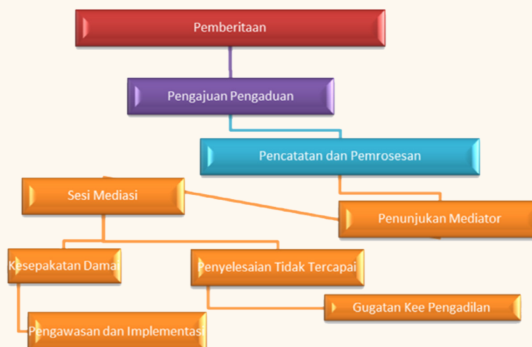
Chart 1.2: Press Dispute Resolution Process Through the Press Council with Out-of-Court Mediation.