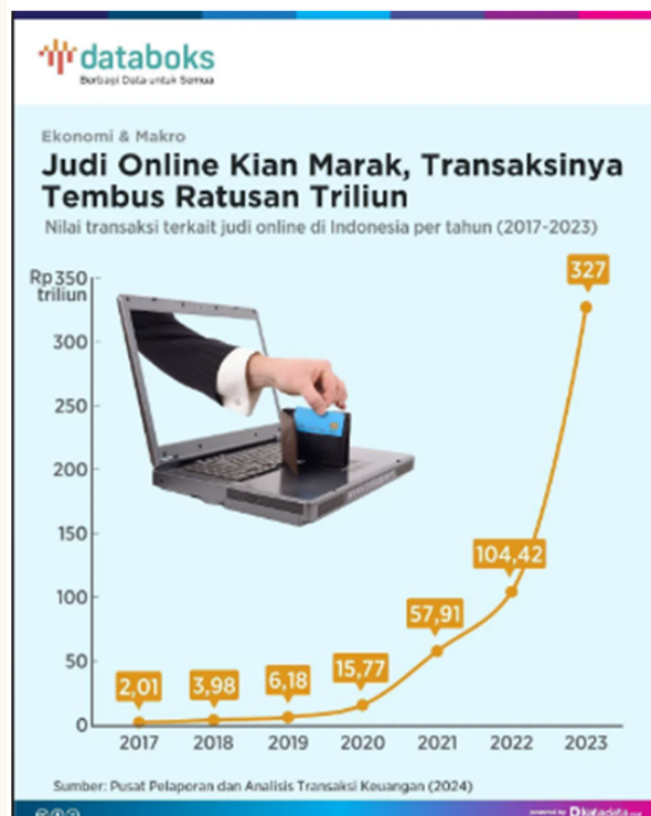
Figure 2: Annual Report of the Financial Transaction Reporting and Analysis Center (PPATK) Value of Online Gambling Transactions as of 2017 – 2023

Law enforcement against online gambling cases has also been regulated in several laws such as in Article 303 of the Criminal Code which is threatened with a maximum prison sentence of ten years. In addition, there are also legal regulations on online gambling in the ITE Law Article 27 Paragraph 2 of Law No. 11 of 2018 concerning information and electronic transactions 10 . In this case, Indonesia itself has not been effective in controlling this phenomenon. There are still many people involved in online gambling practices that negatively impact society and the State. Although there have been many legal regulations that regulate, prohibit, and even sanction this case of online gambling, recent surveys show that the victims of online gambling continue to increase as time goes by.