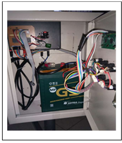
Fig. 2. Inside the Panel Box