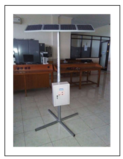
Fig. 3. Overall Tool Shape