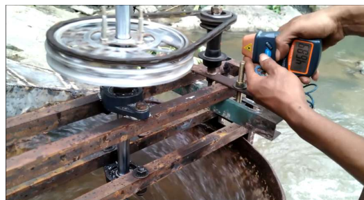
Fig.5. RPM Test Gear 46 : 16