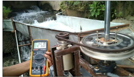
Fig.4. DC Generator Test