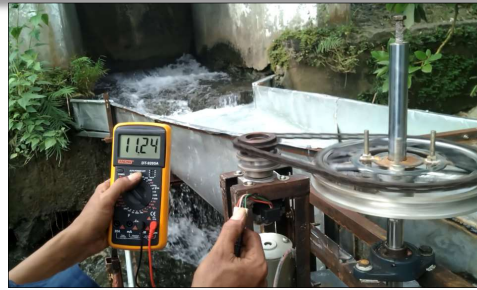
Fig.3. AC Generator Test