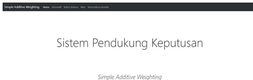
Figure 3. Main Page

The implementation of the Simple Additive Weighting (SAW) method on the system uses PHP language, with database storage on phpMyAdmin, and CSS display. The display flow on the system can be seen below. The Main Page as shown in Figure 3 displays the name of the system and the method to be used and the method to be used.