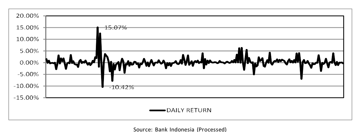
Figure 2. Return To The Us Dollar Daily Rupiahs Period January 2006-December 2016