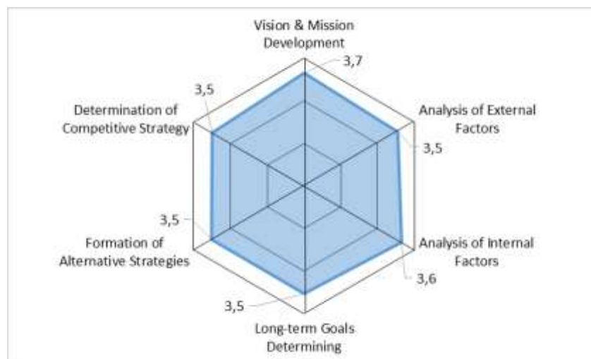
Figure 3. The Result of Strategic Planning