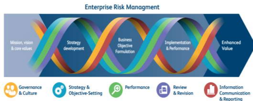
Figure 1. COSO - Enterprise Risk Management with Strategy and Performance Source: (COSO, 2017)

According to COSO in its executive summary, Enterprise Risk Management (ERM) is a process that involves the entire entity, starting from the board of directors, managements, and other officers. It applies the strategy formulation of the entire company and designed to identify potential events that can impact the entity and manage risk at the desired level to provide reasonable assurance in order to achieve the objectives of the entity (COSO, 2017).