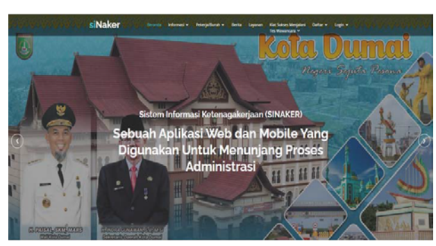
Figure 2. User interface of the official website

The submission stage is the initial stage in which the public can view the requirements online and submit an application to the Employment Information System (SINAKER). Meanwhile, the company can send information on job vacancies and the condition of the workforce owned by the application. To access it, the public and companies can access the official website at the address: https://sinaker-disnaker.dumaikota.go.id. For more details, see the figure 2.