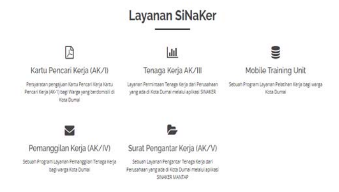
Figure 3. User interface of the official website

In the appearance of this website it can be seen that the Employment Information System (SINAKER) has many menus that are always displayed. The displayed information certainly contains information that is needed by the community. Within the application, there is a menu such as Home, which contains an overview of the application being published. In addition, all services can be seen on the first page, as in figure 3.