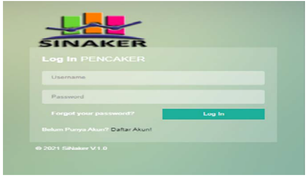
Figure 4. Log in illustration of SINAKER Source: https://sinaker-disnaker.dumaikota.go.id Accessed: 05/03/2023

From the figure 3, it can be seen that there are several service options and some information that can be accessed by the public and companies. The public can access this website and view various types of information. If people want to register as jobseekers, they can also access the login. For the company, to forward information on job opportunities, data on the condition of the company are also logged in. The login display is as in figure 4.