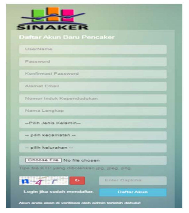
Figure 6. Job Seeker Account Registration Source: https://sinaker-disnaker.dumaikota.go.id Accessed 05/03/2023

There are two types of interaction applications: portals for searching for data seekers and channels that allow people to interact with certain interested units. In this case, the SINAKER Application has a "Register" feature for people who need work. Given the job-seeker registration features by filling in the personal data. The display registration is as in figure 6.