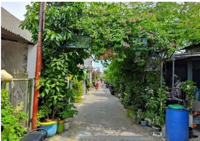
Figure 2. Keputih Tegal Timur Subdistrict after the Government Collaboration Program

icons in the city of Surabaya until 2022 now (Dahli, 2020). With this submission, PT. Astra International plans to build and develop the district of Keputih Tegal Timur. This is because the village also meets predetermined criteria which consist of 3 aspects, namely good district environmental management, district residents who have a mutual cooperation attitude and have easy access to socialize and supervise social responsibility programs (Dahli, 2020).