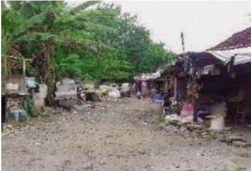
Figure 1. Slum Area of Keputih Tegal Timur Subdistrict