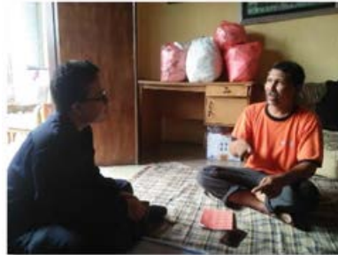
Figure 3. Discussion of requirement analysis at Kampung Cincau

According to the result of the discussion, Kampung Cincau is only recognized through news site channels. Several MSMEs in Kampung Cincau received orders from WhatsApp and social media, which tends to be broadcasting without specific sites. Hence, the community service team would like to develop a website profile that loads the activities of people in Kampung Cincau and sell products from several MSMEs in the food and non-food sector.