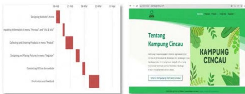
Figure 5. Gantt chart of website design process

Buying a domain and hosting is conducted to create a website profile to give the best community service in Kampung Cincau. The chosen domain is http://www.kampungcincau.com , such that it can be a brand for a village in Surabaya that cultivates cincau. The home display of the website can be seen in Figure 6.