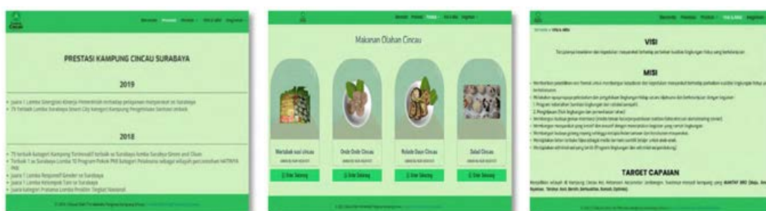
Figure 7. Display of “Prestasi (Achievements)”

The “Visi & Misi” menu tells the visitor about the vision, mission, and achievement targets for the welfare of the society of Kampung Cincau. In this menu, Kampung Cincau gives the main objectives of their existence in Surabaya, Indonesia. The display of the “Visi & Misi” menu is shown in Figure 9.