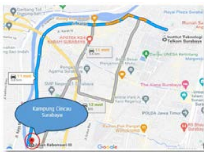
Figure 1. Maps of Kampung Cincou

its various MSMEs' products for further promotions. Business sectors require digitalization in profiling to utilize IT development to promote and sell their products to broader consumers (Sari & Sriwidadi, 2022). Moreover, this rapidly growing IT development could help business activities to be more accessible through website building and mobile improvement (Agustina et al., 2022; Wijayanto & Pratomo, 2022). Consequently, IT development through building a website is important to develop MSMEs at Kampung Cincou to maximize their potential to promote their profile to other regions. Building a website profile is required to promoting products that positively impact the people (Delima & Wibowo, 2020).