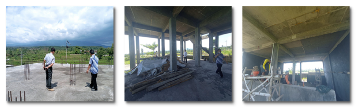
Figure 3. The outreach team, accompanied by the mosque committee and the foundation's education administrators surveyed the Sirothol Mustaqim mosque area

Following the initial identification step, the outreach team conducts a more in-depth field survey to identify energy needs and the potential utilization of solar energy sources at the mosque's location. Involving the mosque committee in this initial stage is crucial because they have a profound understanding of energy consumption patterns in the mosque, existing infrastructure, and potential challenges that may arise in using solar energy. Therefore, the active participation of the mosque committee and the foundation for education in this preliminary study enables community service to design more accurate solutions that align with the mosque's needs and its congregation.