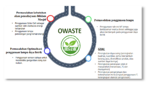
Figure 1. Problem solving solution

efficiency within the mosque. Solar energy utilization in mosques can become a center for education on sustainability and environmental protection in Islam. This can generate theories on how religious principles can be integrated with sustainable practices focused on ecological preservation (Budiman & Utomo, 2018).