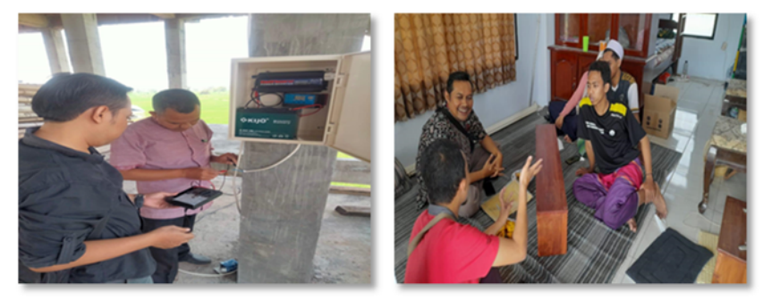
Figure 7. Monitoring and Evaluation Activities

Evaluation will also involve feedback from the mosque's takmir and congregation members who use this technology. By talking to them and listening to their experiences using the Smart Light Solar Cell, the community service team can identify improvements or changes that may be needed in the system or the training provided. Thus, monitoring and evaluation will help ensure that this project successfully achieves its goal of improving energy efficiency in the mosque and empowering the local community to use sustainable technology.