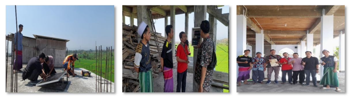
Figure 6. Installation and training with mosque officials

By providing this comprehensive training, it is expected that the takmir and congregation members can effectively manage and utilize Smart Light Solar Cell technology in the day-to-day operations of the mosque. This will improve energy efficiency in the mosque and empower the local community to maintain and sustain this technology.