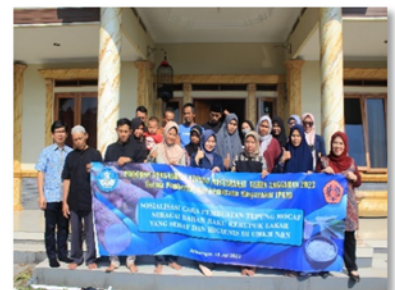
Figure 6. Socialization of how to make MOCAF flour

The process of making MOCAF (Modified Cassava Flour) involves several stages, including peeling, washing, slicing, fermentation, drying, grinding, and sieving (Subagio et al., 2008). MOCAF production is carried out using the dry grinding and fermentation method with slaked lime (3.5 ounces of slaked lime are needed for every 30 kg of cassava). It is crucial to prepare the necessary equipment and materials. The cassava used should be ready for harvest and aged between 6 to 10 months to ensure a substantial yield and smooth fermentation (Permatasari et al., 2018; Wiranti & Indrawati, 2015).