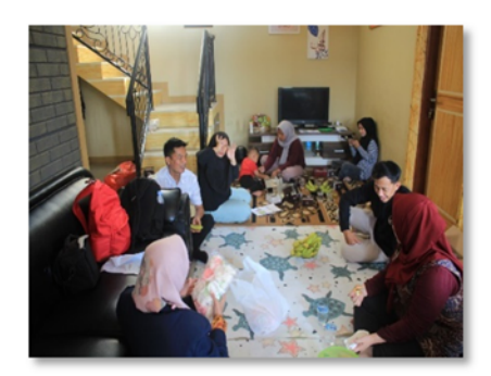
Figure 5. Coordination between the PKM team and partners

18, 2023. This coordination ensured that all parties were aligned on the objectives and logistics of the socialization event.