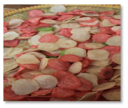
Figure 7. Making lakar crackers using MOCAF flour

The existence of this PKM has had a tremendous impact on the empowerment of the Jatiroke Village Community and N&N MSMEs, one of which is increasing the selling value of cassava into MOCAF flour as a raw material for making healthy and hygienic lakar crackers and can open up business