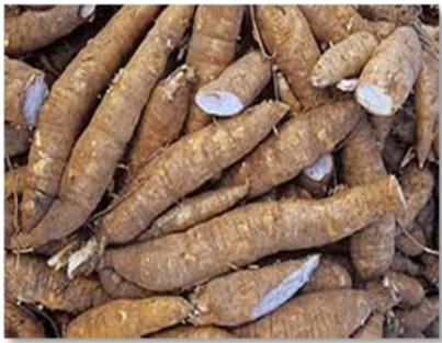
Figure 2. Lakar crackers produced by N&N MSMEs Figure 3. Cassava harvest