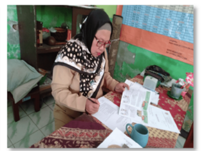
Figure 11. Implementation of the post-test Figure 12. Implementation of the response questionnaire