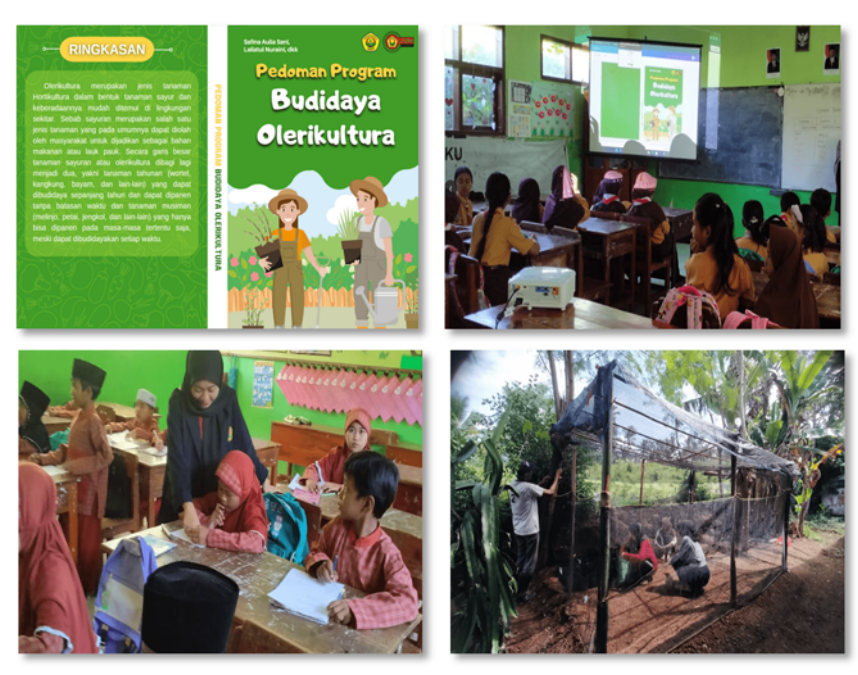
Figure 3. Guidebook cover Figure 4. Program socialization Figure 5. Conducting the pre-test Figure 6. Land preparation

guidebook can be seen in Figure 3; (2) Socialization. The socialization was held on May 27, 2023. In this socialization activity, students were given insights into industrial agriculture regarding the activities that will be carried out during the Promahadesa program. This socialization activity can be seen in Figure 4; (3) Pretest. The pretest was conducted after the socialization activities were carried out. This pretest was conducted with the aim of knowing students' initial knowledge related to olericultural plants. Researchers conducted pretests in two classes, namely classes 5 and 6. This pretest activity can be seen in Figure 5; and (4) Land Preparation. Land preparation was conducted in June 2023. This preparation required several things, namely seeds of ten olericultural crops, organic fertilizer, hoes, clurit, and polybags. This land preparation activity can be seen in Figure 6.