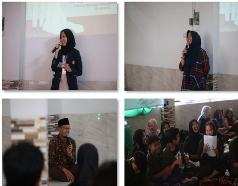
Figure 1. Opening session by facilitators, remarks by the village head, and prayer together by marriage officiant

The psycho-educational session was held on Saturday 29 July 2023. The session was led by one psychologist who specializes in marriage counseling and two developmental psychologists. There were 43 participants, including 27 adolescents and 13 young adults. Most of the participants were from the youth organization of Cipacing Village, with only 8 representatives from local schools being present. It was attended by the Cipacing Village Head, stakeholder who licenses the marriage religiously, and PKK cadre women. The psychoeducation activity was supported by students from different study programs at Padjadjaran University who acted as facilitators. Implementation phase consists of several activities: opening, pre-test, material session, discussion, post-test, games and closing.