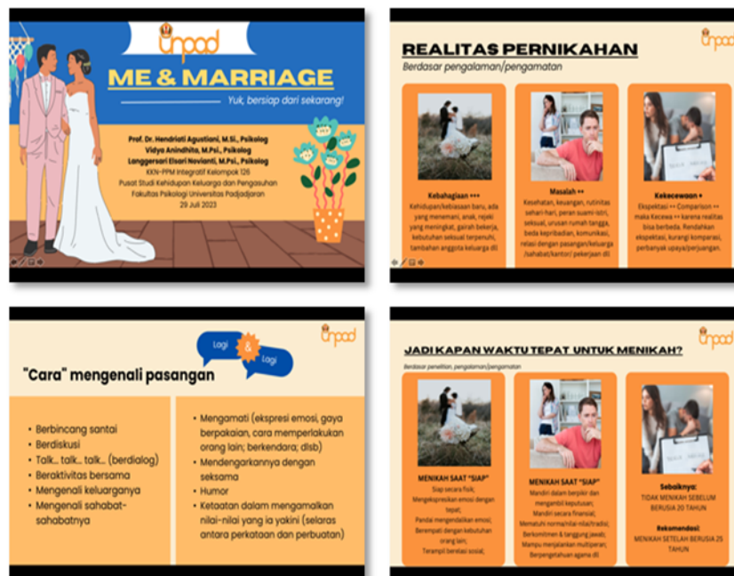
Figure 4. Material sample