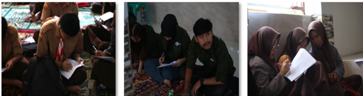
Figure 2. Participants fill out the pretest questionnaire

This psychoeducation activity aims to increase the knowledge of teenagers and early adults in Cipacing Village about the importance of marriage readiness. Therefore, in this activity, pre and post psychoeducation assessments were carried out to see the effect of this psychoeducation activity on the participants' knowledge. The participants' knowledge related to marriage was measured through a pretest questionnaire before the presentation of the material. This pre-post questionnaire contains 15 items in the form of multiple-choice questions related to the activity material, namely the meaning of marriage, things that need to be prepared before marriage and forms of communication in conflict resolution efforts. One example of an item is "What is the main basis in building a strong marriage?". Participants completed the pretest guided by the facilitator for 10 minutes. The stage of completing the pretest questionnaire can be seen in Figure 2.