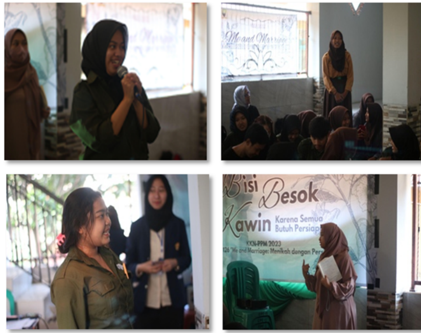
Figure 5. Discussion session

or giving examples of their experiences. The discussion proceeded collaboratively through exchanging views and inviting other participants to share their experiences for mutual learning purposes. Figure 5 provides an overview of the discussion activities.