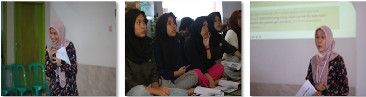
Figure 3. Providing material by resource persons

Observations of the participants’ reactions were also made during this session. Participants seemed to have positive reactions as evidenced by enthusiasm, active listening, taking notes on the material or participants giving examples from their daily observations. The material session and examples of material slides are shown in Figure 3 and Figure 4.