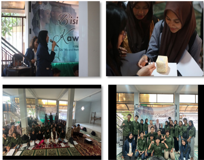
Figure 6. Closing

their pre-test ones at a Mean Rank of 18.00. Additionally, seven people had identical post-test scores to their pre-test ones, thereby presenting no change. Table 1 displays the difference test results.