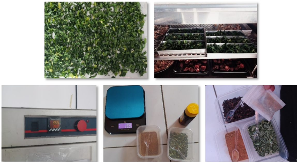
Figure 4. Processing of herbal tea powder and making herbal tea