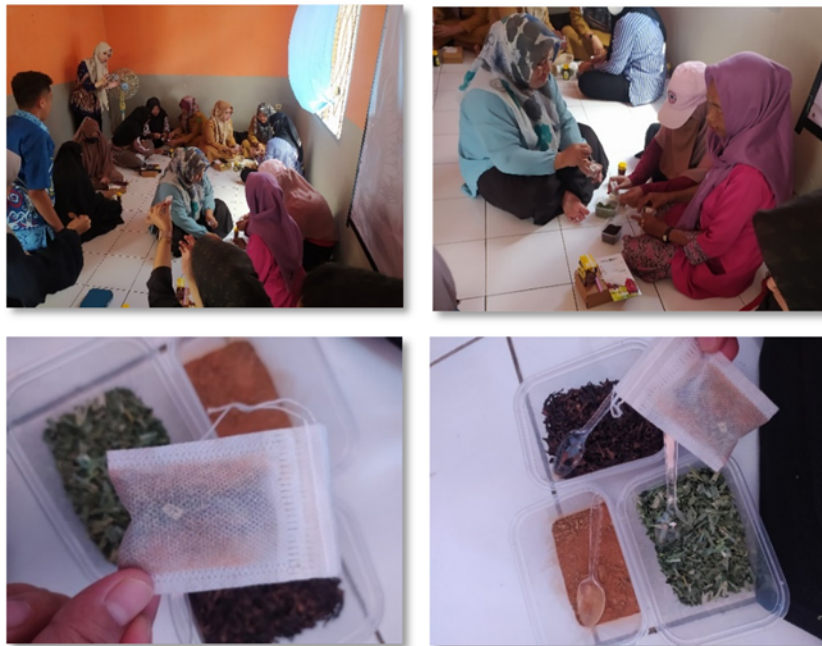
Figure 7. Hands-on tea-making practices

Apart from that, because the participants already know each other, there is no awkwardness between the participants, so communication is not awkward; (4) Availability of raw materials for making tea.