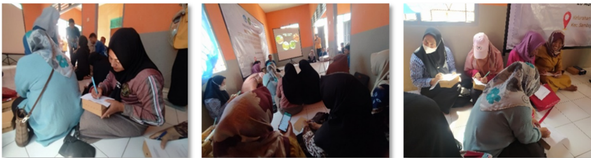
Figure 5. Filling out the questionnaire by training participants

Based on the graph shown in Figure 2, the pre-test and post-test of the counseling carried out shows that there was an increase in the average knowledge before and after the counseling. The lowest average score before counseling was 50 and after counseling it increased to a score of 80. At the counseling stage, 2 materials were given regarding degenerative diseases and material regarding the nutritional content of plants used as herbal tea.