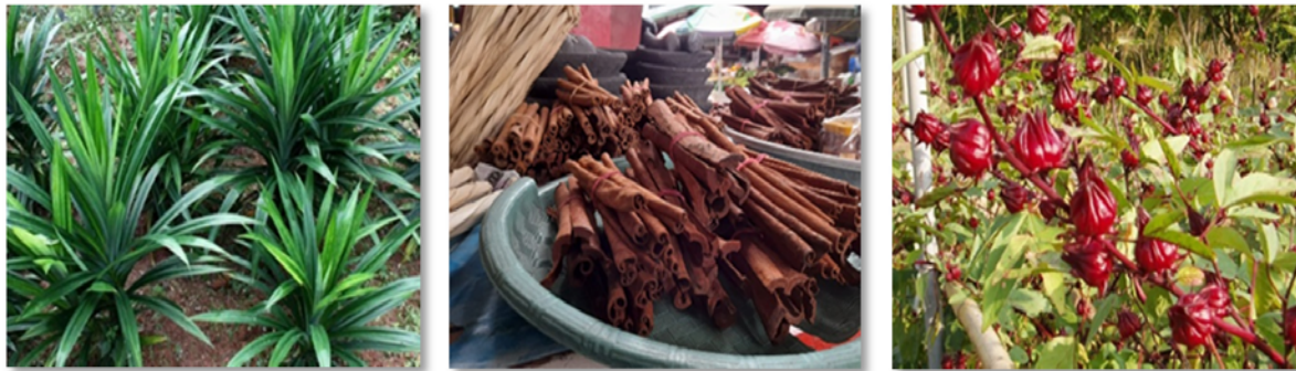
Figure 3. Plants as raw materials for making herbal tea: (1) Pandan leaves ( Pandanus amaryllifolius ); (2) Cinnamon ( Cinnamomum burmanii ); (3) Roselle flower ( Hibiscus sabdariffa )

Material selection as part of the preparation stage for implementing community service. This stage aims to enable people to know the good ingredients that can be used in making tea. The selection of materials was carried out in 2 locations, the first location was Teluk Pamedas Village for collecting pandan leaves and rosella flowers, the second location was Samarinda City for selecting cinnamon because it was not found at the location. Community service was carried out in July 2023. Furthermore, after collecting the raw materials, several samples of the plants were taken to the pharmacy faculty laboratory at Mulawarman University for processing. Techniques for selecting raw materials need to be applied, for example, leaf picking which is done using the tea leaf picking formula. This is done to maintain the quality of the tea leaves produced (Amanto et al., 2020). This is carried out as a provision to increase the knowledge and training abilities of participants regarding the basic ingredients of a product especially natural ingredients that can be used as herbal medicines. The tea referred to in this dedication is not tea ( Camelia sinensis ). Plant organs that can be processed into herbal tea also vary from leaves, roots, stems, flowers, and fruit that come from plants but from several herbal plants (Triandini et al., 2022).