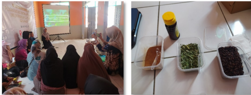
Figure 6. Training on making tea from a combination of rosella flower petals, cinnamon, and pandan leaves

The next activity was training in making tea using local plant foods including cinnamon, rosella flower petals, pandan leaves, and honey. This training is accompanied by presenters who are experts in their fields. Participants seemed very enthusiastic about following the presentation of the material and continued with direct practice accompanied by assistants who were experts in their fields as well. This training is equipped with several tools and materials that are ready for use by participants.