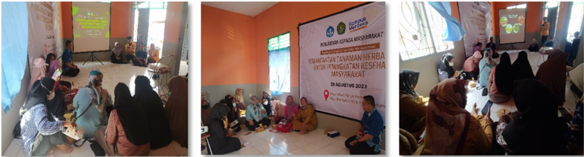
Figure 1. Counseling on degenerative diseases and nutritional diet for hypertension sufferers