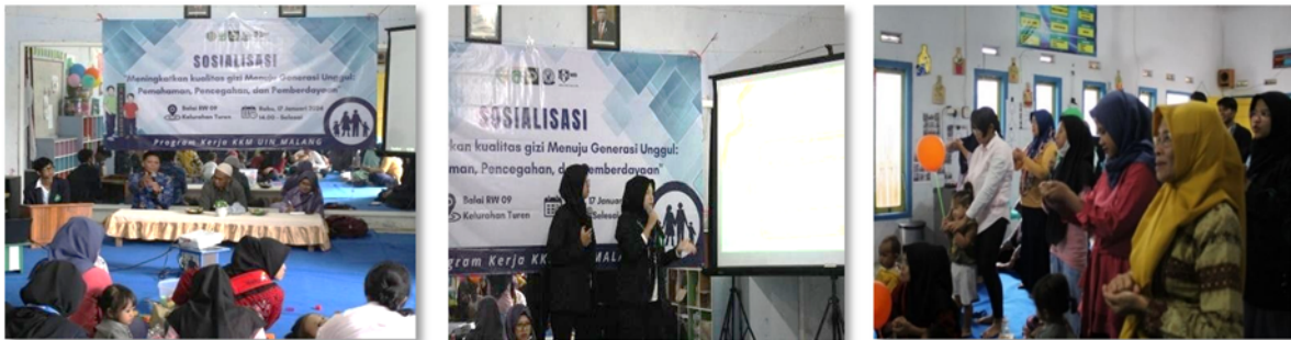
Figure 1. Socialization activities participated in by various community figures Figure 2. Presentation of balanced nutrition material using the Fill My Plate Method Figure 3. Practice of hand washing by women from RW 09 Turen Village

Halimatus Sa'diyah, Ainassabih Liwani Syarafina, Dzuhri Ananda Firdaus, Mitra Dwi Murti