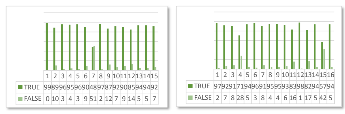
Figure 2. Questionnaire 1 Figure 3. Questionnaire 2

Based on the evaluation of the results of the questionnaire distributed, it was stated that students' knowledge about reproductive health was good and their behavior towards early sexual prevention was good.