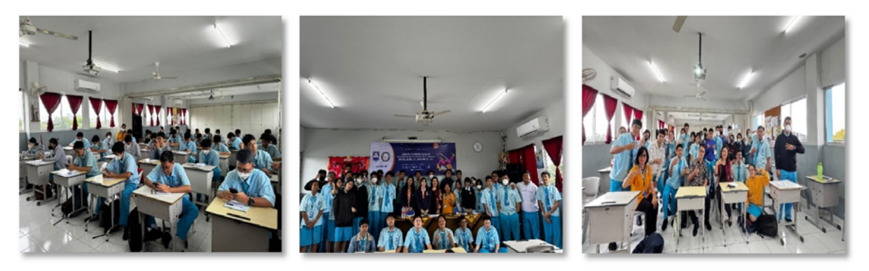
Figure 6. Assistance regarding tax awareness from an early age

In order to build nationalistic spirit and character, integrating education about tax awareness into the Pancasila and Civic Education curriculum is considered crucial. This aims to foster an understanding of the importance of tax contributions for students. This education plays a vital role in instilling values of love and loyalty to the country, rooted in the principles of Pancasila. Through this approach, it is hoped that it can encourage the formation of responsible citizens in terms of tax obligations, which is one aspect of civility.