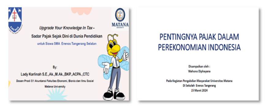
Figure 4. Training modules

responses afterwards indicated the impact and benefits of the applied method, where at the beginning of the session, students were presented with an initial test consisting of a series of questions on tax matters, accessible in Table 4.