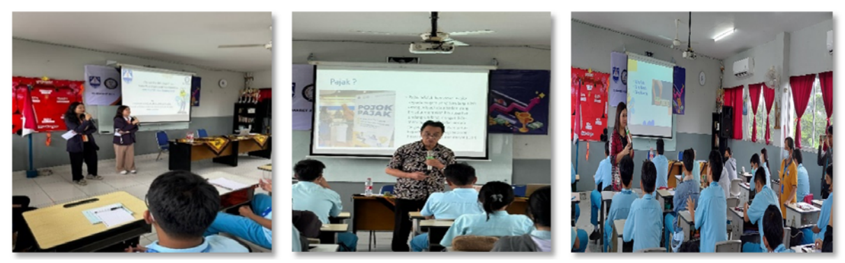
Figure 2. Presentations, training, and discussions

The implementation of this educational session was successfully carried out thanks to the communicative agreement between the faculty of Matana University and SMA Erenos Tangerang, which was arranged in the planning phase. The details of the implementation process are as follows: (1) As an opening activity, the PKM team administered a pretest to participants to measure their level of understanding and awareness about taxes; (2) The delivery of counseling material used a varied and interactive lecture approach to comprehensively explain tax concepts, with several speakers presenting the material as shown in Figure 2.