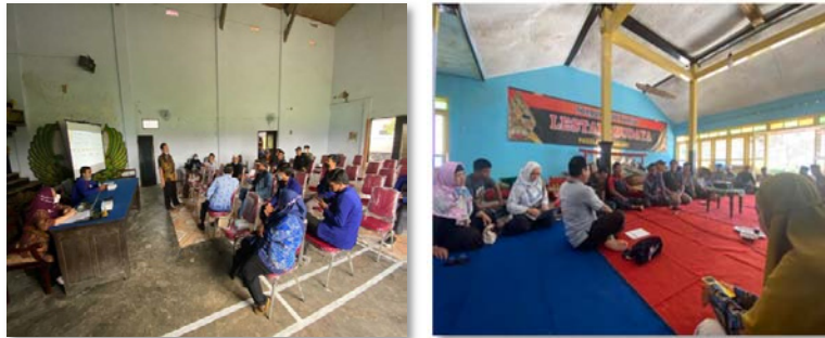
Figure 3. FGD with village government and Mentaraman figures Figure 4. Active discussion on art promotion focus

suggests creating an environment that supports the development of the arts, cares for cultural heritage, and provides meaningful experiences to visitors. While these requirements may vary depending on the local context and objectives, some general requirements that must be met for a particular village to become an arts and culture village include (Susyanti, 2013) a rich arts and cultural heritage, an active arts community, an education and training centre, cooperation with educational institutions, regular arts programs and events, educational tourism experiences, partnerships and collaborations, and environmental conservation. These requirements describe a comprehensive vision for a village to become an arts and culture centre.