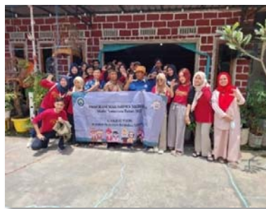
Figure 4. Partnership and collaboration between UM and Pagelaran Village, Malang Regency

These activities are not only about providing entertainment or artistic skills but also about imparting values, knowledge, and awareness to participants. By integrating educational messages, art and cultural program participants can gain a deeper understanding of important issues in society. For instance, in dance or drama performances, moral or ethical messages can be integrated to teach positive values to the audience. Considering that art has the power to communicate messages in a creative and engaging way, integrating educational messages through art can make these messages more easily understood and accepted by the audience, especially when conveyed through powerful art forms. By combining educational aspects into art and cultural programs, visitors or tourists can have a holistic experience that not only stimulates their senses but also their minds and emotions. This can enhance the value of the experience. In essence, integrating educational messages into art and cultural enrichment is about leveraging the appeal of art to convey beneficial and educational messages to the community. This approach is effective for achieving educational goals while preserving the unique artistic and cultural values of a region (Irfan & M, 2018).