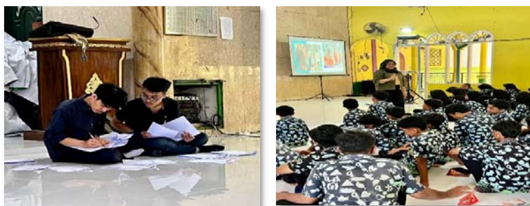
Figure 2. Community service assistants handling questionnaires in the pre-test

Socialization material was given after the pre-test in PowerPoint, which was presented using a laptop connected to a projector (Figure 3). As explained in the Method section, the socialization material provided information on the existence of official religions in Indonesia, the results of a survey in East Java regarding religious intolerance, the meaning of religious tolerance, and the reasons for the importance of religious tolerance in Indonesia. The socialization also outlined the types of religious tolerance, concluding with an explanation of nationalism and religious moderation as inclusive awareness and identity that are important and relevant for improving understanding and levels of religious tolerance in Indonesia.