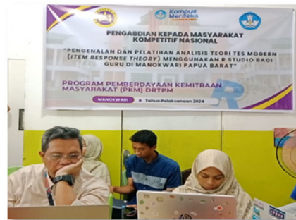
Figure 8. The atmosphere of the training process using R Studio for modern test theory