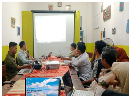
Figure 7. Presentation of introductory material on modern theory by the community service team

The results of the initial capability analysis are used as an essential reference for the teams to prepare for the next steps. The community service team held a follow-up meeting to prepare the form of community service that will be carried out with partners. It was decided to carry out the first stage of community service activities, with the main focus being the introduction of modern test theory while providing an initial introduction to R Studio.