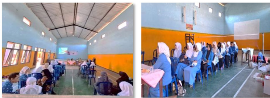
Figure 3. Implementation of socialization

The material was presented by a team of lecturers, covering topics related to differentiated learning in PAUD institutions. This material aimed to enhance teachers' understanding of fulfilling the new paradigm of learning in the Merdeka Curriculum (Jannah & Rasyid, 2023). An overview of the first day's activities can be seen in Figure 3.