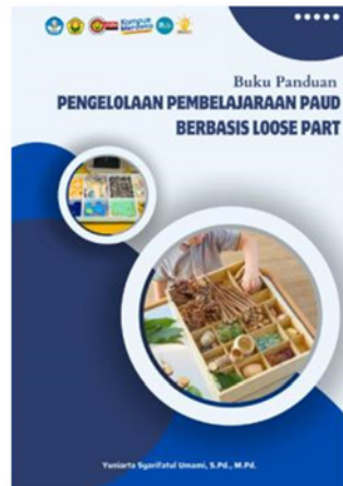
Figure 2. Loose part-based PAUD learning management guidebook

During implementation, this community service activity was conducted over two face-to-face sessions on July 16–17, 2024, at the PGRI building in Jelbuk District, Jember Regency. Based on the implementation stages, the results of the activities carried out are described as follows: