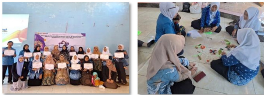
Figure 6. Activity implementation stage

After the implementation, each participant received a certificate of participation as a form of appreciation, as shown in Figure 6. The awarding of rewards serves as recognition for teachers who participated in the mentoring activities (Husain et al., 2023).