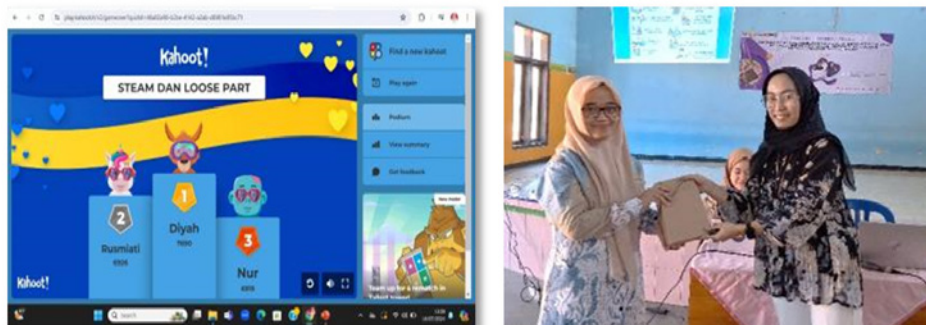
Figure 5. Game winners and distribution of door prizes

By considering both answer accuracy and response time, participants became more focused on answering each question. At the end of the activity, door prizes were awarded to the three participants with the highest number of correct and fastest answers as a form of appreciation. The implementation of the game and the awarding of door prizes are shown in Figure 5.