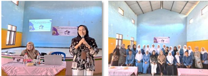
Figure 4. Workshop implementation

This session referred to the Guidebook on Managing Learning with Loose Parts, which has been registered with HKI under Copyright Registration Number 000650541 (Umami, 2024). In this material, participants were introduced to: Definition of Loose Parts, Importance of using Loose Parts, Various Loose Parts components, Various Loose Parts components, Benefits of using Loose Parts, Implementation of learning using Loose Parts, Implementation of learning using Loose Parts, Practical usage examples, Techniques for formulating provocation sentences. The documentation of the activity is shown in Figure 4.