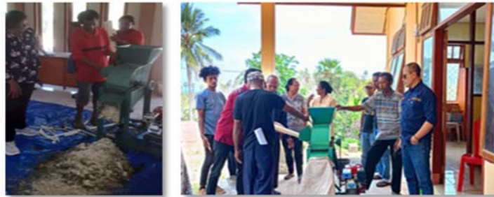
Figure 3. The process of cutting banana stems, vegetables, and papaya leaves

The practical implementation of fermented feed production used agricultural byproducts such as banana stems, vegetable scraps, and papaya leaves (Figure 3). For this activity, Bapperida provided a chopper machine to process these materials. Chopping reduces the size of the materials and increases their surface area, thereby facilitating the fermentation process (Dewi et al., 2024).