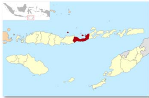
Figure 1. Sikka district location on map

The approach used in this community service activity was Participatory Action Research (PAR), in which the community service team and partners collaboratively identified priority issues and developed practical solutions. This activity was conducted in Waigete Village, Waigete Subdistrict, Sikka District, involving 30 pig farmers as participants (Figure 1).