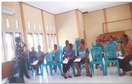
Figure 2. Dissemination

The dissemination was conducted through presentations to pig farmers (Figure 3), covering methods to improve feed quality by processing local ingredients into silage and combining them with other local materials to produce complete feed rations. Pig production can be improved by providing adequate nutrition through the use of banana stem-based silage. The use of banana stem silage through fermentation offers several benefits, including reduced production costs, increased income, and improved farmer welfare (Kertiyasa et al., 2025b). In addition, interactive discussions with pig farmers were carried out to stimulate engagement and identify potential challenges. During these discussions, farmers raised questions about the silage-making process, feeding techniques, and proper management practices to prevent disease in pigs.