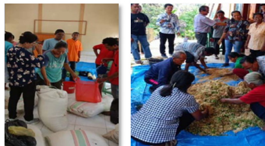
Figure 5. Practice of making fermented feed

In addition, materials such as Effective Microorganisms (EM-4), rice bran, sugar, and salt are also needed. In this activity, farmers brought banana stems, papaya leaves, and vegetable scraps, which were then mixed and chopped as shown in Figure 5. The mixtures are measured using a bucket to determine the ratio with rice bran. The ratio of banana stems, vegetables, and rice bran was set at 5:1, meaning that five gallons of chopped agricultural byproducts were mixed evenly with one gallon of rice bran. Next, a solution of EM-4 probiotics, sugar, and water was prepared in a ratio of 10:10:1000 (in milliliters) and mixed thoroughly until well combined. The prepared solution is then evenly applied to the mixture of bran, chopped banana stems, and vegetables until fully distributed, after which 200 grams of salt is added to enhance the palatability of the silage (Enga et al., 2025). The well-mixed ingredients are then fermented inside an airtight plastic drum for approximately 4 days (Sander et al., 2024). The ingredients are added in batches and compacted to maximize the fermentation process, then tightly covered.