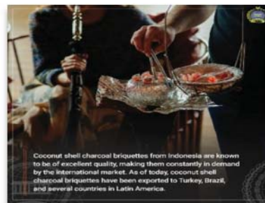
Figure 4. Utilization of charcoal briquettes for culinary