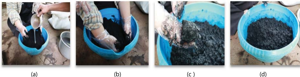
Figure 14. Mixing process of the glue and charcoal powder, (a) Mixing the glue, (b) Stirring, (c) Mixing result, (d) Final result

The next step is to mix the charcoal with tapioca flour proportionally between the glue and coconut shell charcoal. The adhesive is used to attract water and create a dense texture or glue two substrates to be glued by mixing tapioca starch water with charcoal powder, as shown in Figure 14.