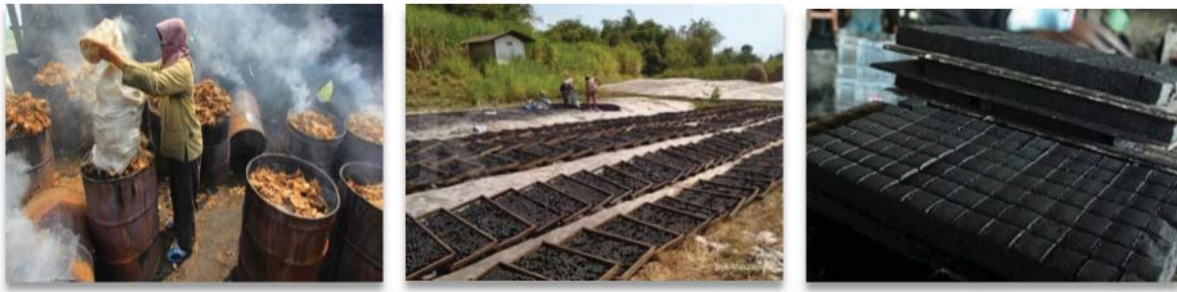
Figure 1. Burning process of coconut coir