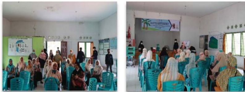
Figure 9. Participants and committees of PDKMI "Briketku" Village Development Program Socialization