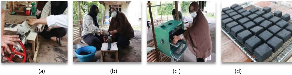
Figure 15. Process of making briquette charcoal, (a) Printing, (b) Cutting, (c) Drying, (d) Final result