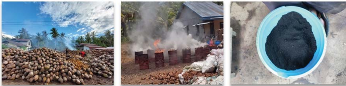
Figure 11. Process of making coconut shell charcoal

The coconut shell charcoal that has been removed from the combustion drum is then pulverized with a charcoal crusher until smooth, as shown in Figure 13. This is done to facilitate mixing with glue made from tapioca flour.