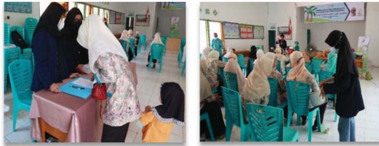
Figure 7. The registration process for the participant in PDKMI "Briketku" Village Development Program Socialization