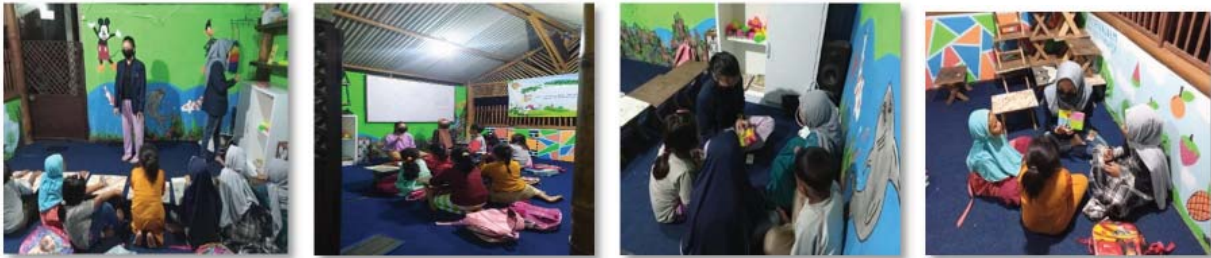
Figure 5. Main instruction delivery Figure 6. Small group practice

The teaching techniques carried out by the first group were quite varied. Starting from short but interesting presentations, to pronunciation exercises wrapped in songs. The teaching participants also seemed enthusiastic and participated in the activities that had been prepared by the first group. The teaching pattern always begins with the main instructions as shown in Figure 5, then continues with small group exercises as shown in Figure 6.