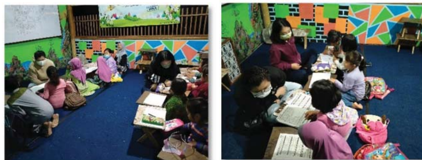
Figure 7. Group 2 teaching and learning process

The technique used by the second group was not much different from what the first group had done. However, the second group started to get used to using English as the language of instruction even though the portion was not much. The activities carried out by the second group are illustrated in Figure 7.