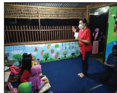
Figure 3. TOT online session Figure 4. Introduction session