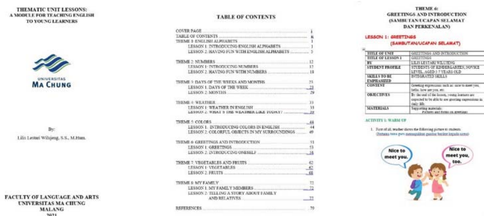
Figure 2. Learning module

The preparation of the learning module was carried out and developed by Mrs. Lilis Lestari Wilujeng as an expert in the TEYL field. The module used is entitled "Thematic unit lessons: A module for teaching English to young learners". This module contains 8 major themes as listed in Figure 2, namely: (1) Alphabet; (2) Number; (3) Name of day and month; (4) Weather; (5) Color; (6) Greetings and self-introductions; (7) Fruits and vegetables; (8) Family. All the themes contained in this module are adapted to the abilities of the participants, so variations in teaching may differ from those in the module. Nevertheless, the given theme remains the same.