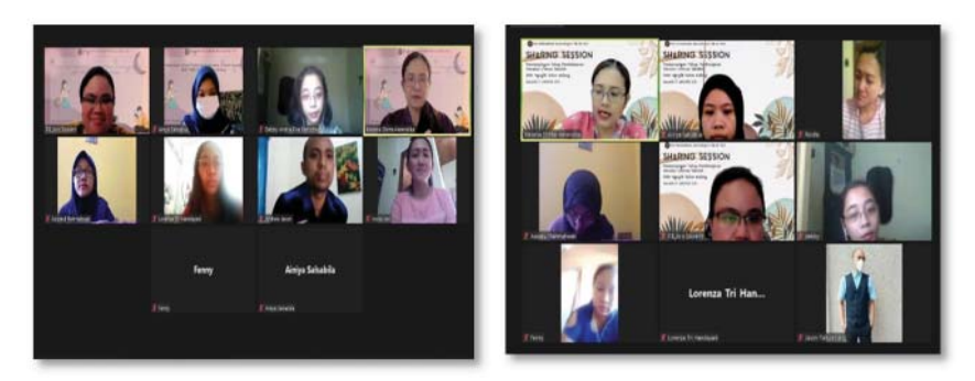
Figure 2. Workshop Figure 3. Sharing session

ABDIMAS: Jurnal Pengabdian Masyarakat Universitas Merdeka Malang Volume 7, No 3, August 2022: 634-643