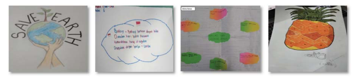
Figure 4. Student works

earth protection and their background knowledge and skills, like how to visualise the earth's shape, write short messages, and select appropriate colouring.