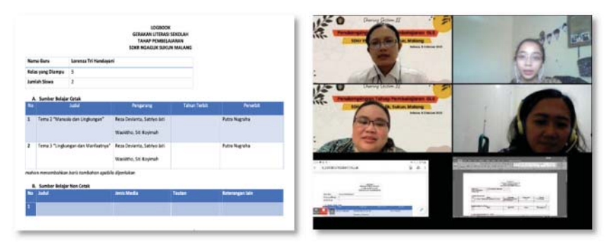
Figure 5. Teacher's logbook (sample) Figure 6. Evaluation

In addition to time restrictions and distance learning, implementing the Learning Stage was challenging because some students had issues using the Indonesian language and lack of interest in the reading material provided. However, teachers still felt motivated to find reading materials that interested