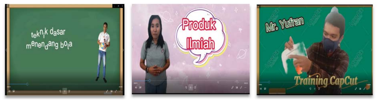
Figure 6. Learning videos made by the participants