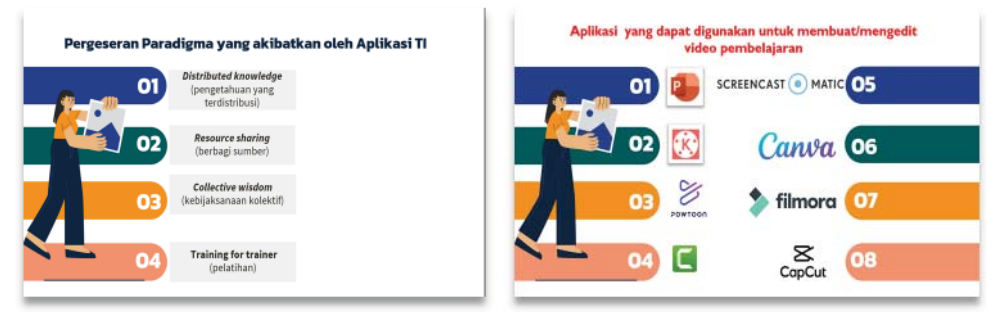
Figure 4. Slides of the presented materials

made (Figure 7) are then displayed for joint viewing by the participants and the implementation team. From the mentoring session on making learning videos using CapCut media, it can be seen that there is an increase in knowledge and skills in making learning videos using CapCut. The training participants who previously did not know the CapCut application and how to use it could produce simple learning videos according to the instructions from the presenters and facilitators at the end of the activity.