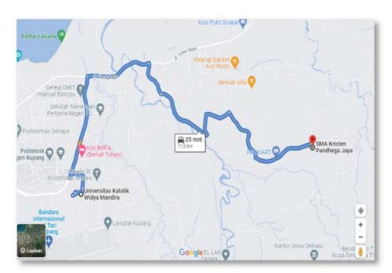
Figure 1. Location map of service activities

The training activity for making learning videos was carried out at SMA Kristen Pandhega Jaya, Kupang Regency (Figure 1) on January 21, 2022. Twenty (20) teachers of SMA Kristen Pandhega Jaya were the training participants. The speaker in this training activity is a lecturer of the service team from the Chemistry Education Study Program at Universitas Katolik Widya Mandira. The materials presented are included: the role of technology in education in the present and future, learning media, learning videos, applications used in making learning videos, and tutorials on using the CapCut application in training. The stages in this service activity include preparation or planning, implementation, monitoring, and evaluation.