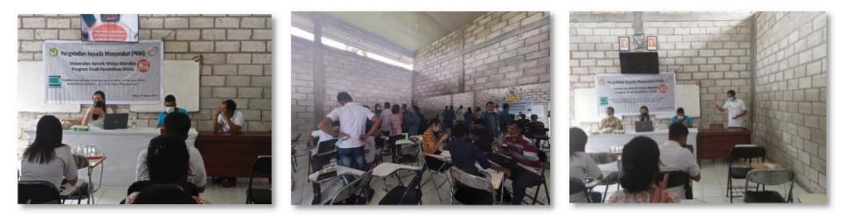
Figure 3. The implementation of activities (opening, materials presentation, and mentoring)

The training activity for making learning videos was carried out at SMA Kristen Pandhega Jaya for one day on January 21, 2022. This activity started from 12.00 – 16.00 WITA with twenty (20) participants. The activities include opening, material presentation, and assistance in making learning videos (Figure 3). The implementation of the training activities was carried out by the implementation team's leader and the team members and assisted by three students of the Chemistry Education study program of Universitas Katolik Widya Mandira.