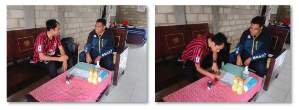
Figure 2. Interview and signing of cooperation agreement between the service team and SMA Kristen Pandhega Jaya

The teachers hold significant responsibility in carrying out the learning process as it is according to the school vision, preparing prospective leaders who are capable, with integrity, and full of dedication and love for the nation. During the interview, the principal said that teachers must be equipped with innovative and creative learning concepts to manage the learning process well. In addition, teachers must be active and have the skills to develop media design to create effective and fun teaching and learning activities for students and teachers. At the end of the interview with the principal, an agreement was reached between the service team of Universitas Katolik Widya Mandira and SMA Kristen Pandhega Jaya to make a training activity about making learning videos in order to improve the teachers' pedagogic abilities (Figure 2).