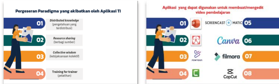
Figure 4. Slides of the presented materials

made (Figure 7) are then displayed for joint viewing by the participants and the implementation team. From the mentoring session on making learning videos using CapCut media, it can be seen that there is an increase in knowledge and skills in making learning videos using CapCut. The training participants who previously did not know the CapCut application and how to use it could produce simple learning videos according to the instructions from the presenters and facilitators at the end of the activity.