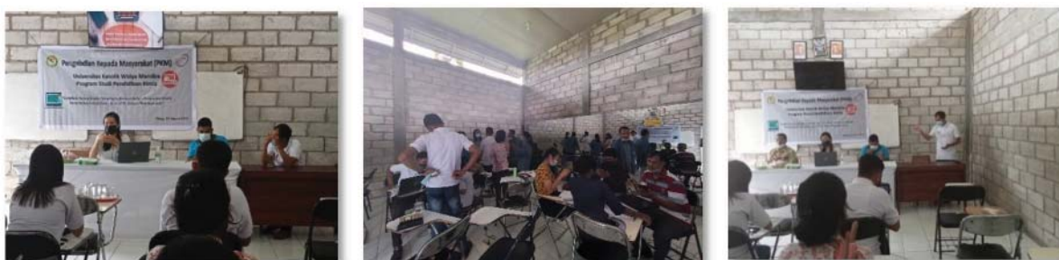
Figure 3. The implementation of activities (opening, materials presentation, and mentoring)

The training activity for making learning videos was carried out at SMA Kristen Pandhega Jaya for one day on January 21, 2022. This activity started from 12.00 – 16.00 WITA with twenty (20) participants. The activities include opening, material presentation, and assistance in making learning videos (Figure 3). The implementation of the training activities was carried out by the implementation team's leader and the team members and assisted by three students of the Chemistry Education study program of Universitas Katolik Widya Mandira.