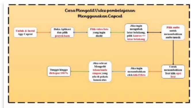
Figure 5. A brief tutorial on operating the capcut application