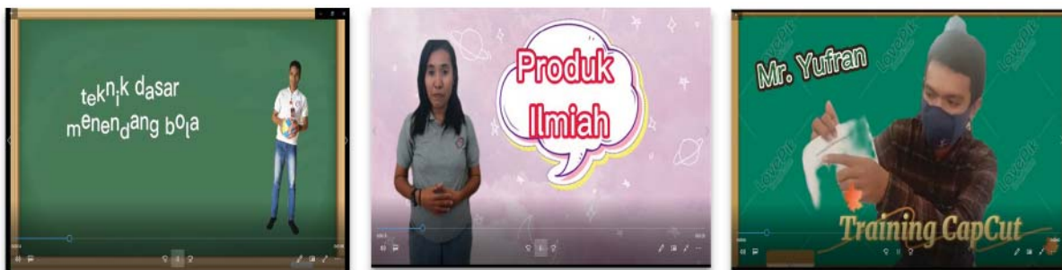
Figure 6. Learning videos made by the participants