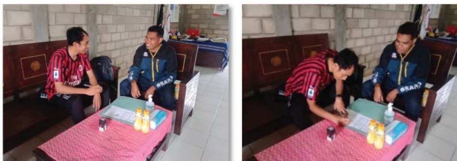
Figure 2. Interview and signing of cooperation agreement between the service team and SMA Kristen Pandhega Jaya

The teachers hold significant responsibility in carrying out the learning process as it is according to the school vision, preparing prospective leaders who are capable, with integrity, and full of dedication and love for the nation. During the interview, the principal said that teachers must be equipped with innovative and creative learning concepts to manage the learning process well. In addition, teachers must be active and have the skills to develop media design to create effective and fun teaching and learning activities for students and teachers. At the end of the interview with the principal, an agreement was reached between the service team of Universitas Katolik Widya Mandira and SMA Kristen Pandhega Jaya to make a training activity about making learning videos in order to improve the teachers' pedagogic abilities (Figure 2).