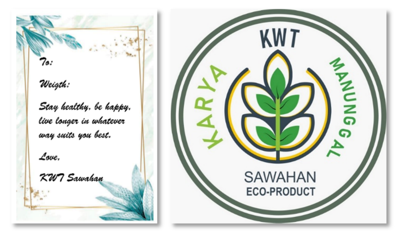
Figure 3. Logo and education of eco-friendly vegetable products

The product logo is the identity of a sign of ownership, and the product must also be packaged attractively without compromising its product quality. For example, in Figure 4, an environmentally friendly vegetable product packaging is presented using the basic material of bamboo. In addition, product packaging uses woven bamboo coated with temulawak leaves, which is the novelty of this method. This team's eco-friendly vegetable packaging design has been registered and received a copyright certificate from the Directorate General of Intellectual Property under the Ministry of Law and Human Rights.