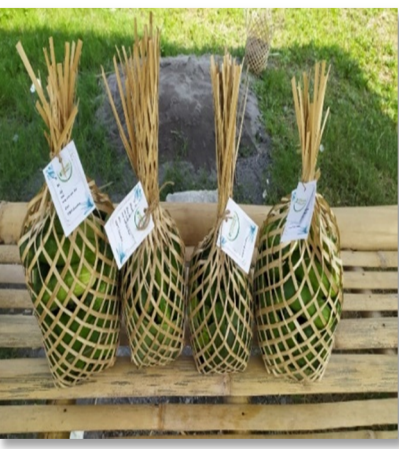
Figure 4. Eco-friendly vegetable packaging

The green place for product distribution is done by using digital marketing. The high use of the internet by the community exploited the opportunity for marketing environmentally friendly vegetables using social media. In the first stage, the product is offered through social media groups with the WhatsApp application targeting office workers. In the next stage, the service team helped KWT members by introducing their products through an application for selling organic vegetables in the Special Region of Yogyakarta and joining siBakul Jogja, a market hub developed by the SME and Cooperatives Service.