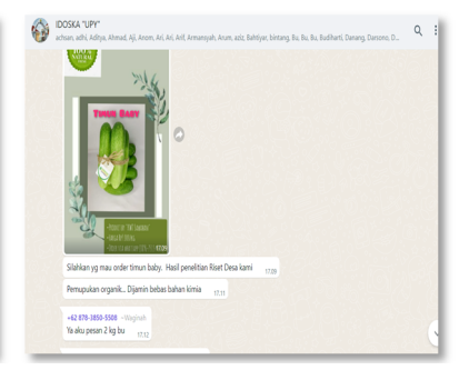
Figure 5. Product photos for Green Promotion Figure 6. Testimonials of consumer responses to the WhatsApp group

In Figure 6, testimonials of the speed of social media are presented as free promotional media by carrying green promotion. The advertisement was launched at 17.11 minutes, and incoming goods order was already received at 17.12 minutes, according to the screenshot of the mobile phone display.