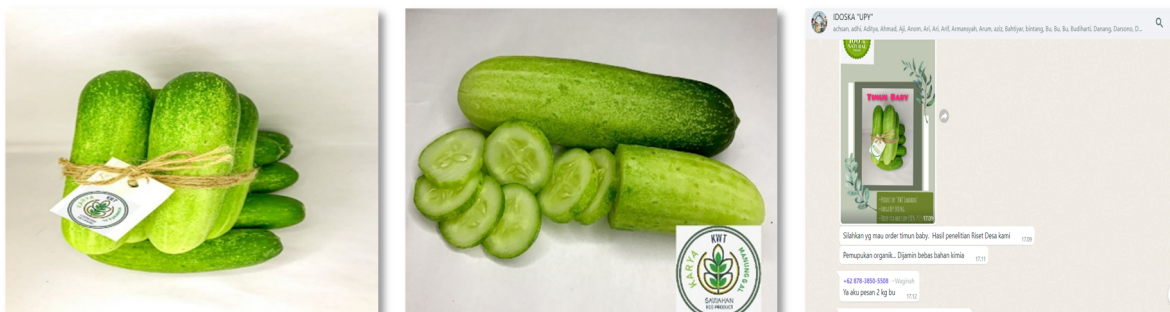
Figure 5. Product photos for Green Promotion

Green promotion is implemented by creating a cost-effective advertising concept that pays attention to environmental sustainability. For example, promoting environmentally friendly vegetables is done by taking interesting photos of vegetables, then uploading them on social media. Figure 5 presents an example of a baby cucumber upload, which is often uploaded as a WhatsApp status.