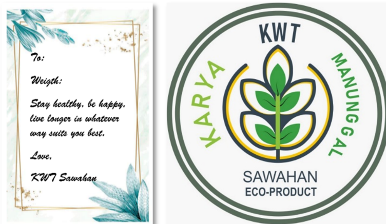
Figure 3. Logo and education of eco-friendly vegetable products

The product logo is the identity of a sign of ownership, and the product must also be packaged attractively without compromising its product quality. For example, in Figure 4, an environmentally friendly vegetable product packaging is presented using the basic material of bamboo. In addition, product packaging uses woven bamboo coated with temulawak leaves, which is the novelty of this method. This team's eco-friendly vegetable packaging design has been registered and received a copyright certificate from the Directorate General of Intellectual Property under the Ministry of Law and Human Rights.