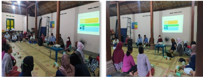
Figure 2. Implementation of Focus Group Discussion on marketing strategy

visual product identity is created in the form of a logo. A logo can be said as the face of a brand. In Figure 2, an agreement is made on the logo and educational sheet included in the packaging to package environmentally friendly vegetable products from KWT Karya Manunggal.