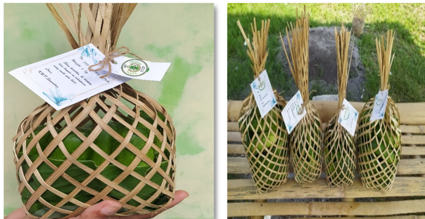
Figure 4. Eco-friendly vegetable packaging

On this basis, the product's pricing is taken in the middle position. Baby cucumber vegetables with chemicals are sold for IDR3,500.00/kg, while the organic category is priced above IDR11,000.00/kg. The product of baby cucumber vegetable product by KWT Karya Manunggal is sold for IDR7,000.00/kg.