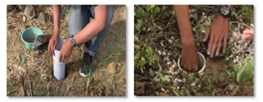
Figure 3. How to install biopore infiltration hole pipe into the ground Figure 4. How to fill organic waste into biopore infiltration hole