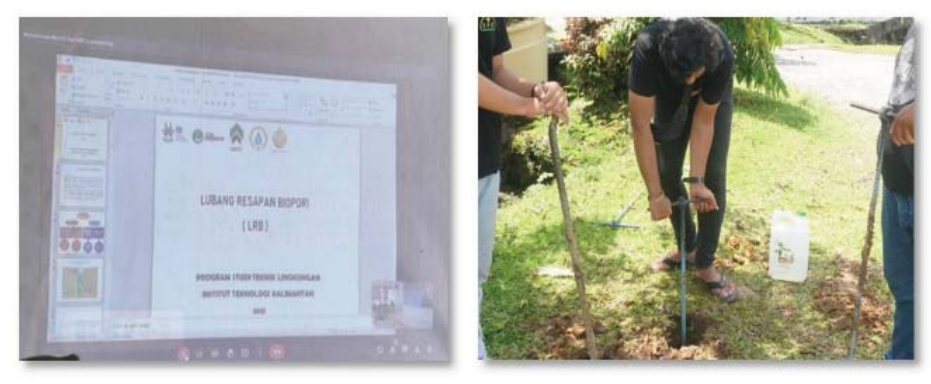
Figure 7. Documentation of the First Day of Community Service

biopore infiltration holes. Residents of RT.18 Housing Pondok Karya Agung Sungai Nangka Village were very enthusiastic in understanding the material. Before the socialization material, residents were given a paper containing a questionnaire aimed at measuring the level of initial understanding of the community towards biopores.