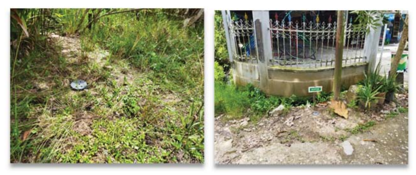
Figure 10. Monitoring biopore infiltration holes

Based on the results of the monitoring, the biopore infiltration holes has not worked optimally because the organic waste has not been completely decomposed. Baguna et al. (2021), stated that the biopore infiltration holes in the absorption of rainwater is said to be optimal characterized by no puddles of water around the hole and the decomposition of organic waste that is inserted into the hole, and the formation of organic fertilizer from the utilization of the organic waste.