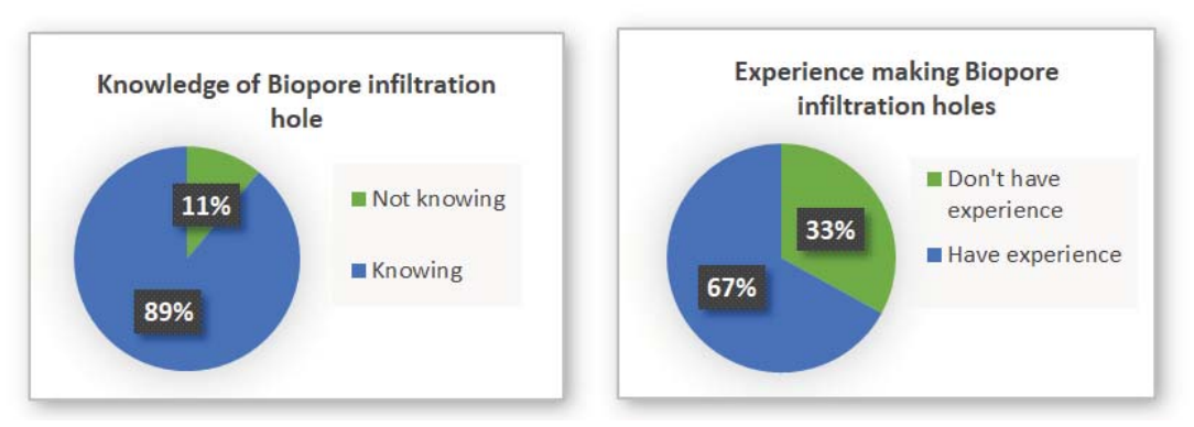
Figure 9. Pre-socialization questionnaire results

In accordance with the purpose of implementing the activity, this community service can increase the understanding and interest of residents to implement biopore infiltration holes as an effort to prevent flooding of RT.18 Pondok Karya Agung Housing, Sungai Nangka Village. This can be shown in the results of the questionnaires that have been filled out by residents.