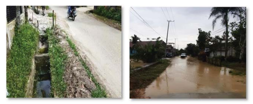
Figure 5. Location survey

puddles when it rains in the area of RT.18 Housing Pondok Karya Agung Sungai Nangka Village. When determining this point, checking the soil condition is also carried out to determine whether or not it is easy to use a biopore drill.