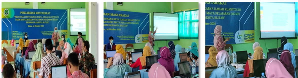
Figure 2. Service activity