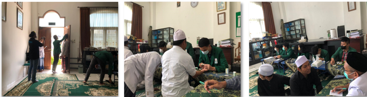
Figure 3. BMI and random blood sugar checks as well as health checks

In this community service activity, it also showed that the results of random blood sugar examinations in students were 62.96% in the pre-diabetic category, and 18.52% were found in the non-diabetic category. This result can be influenced by one of the risk factors, namely nutritional disorders which can be seen from the results of the BMI examination, which are mostly overweight and obesity.