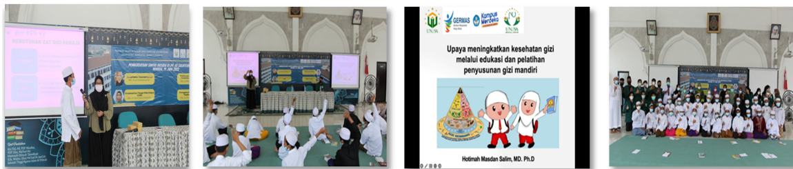
Figure 1. Youth nutrition health socialization activities

Prior to carrying out the activities, FGDs were conducted to convey the activities to be carried out and their preparations. From the results of the FGD, it was agreed that all activities were carried out on June 19, 2022 and involved Husada students and the doctors who were in charge of the Poskestren. This community service activity was carried out at the Al-Fitrah Kedinding Islamic boarding school, Surabaya. This activity refers to the problems found in Islamic boarding schools in general, where the health and fulfillment of balanced nutrition in adolescents is still not optimal. By trying to empower Husada and Posketren students in Islamic boarding schools, this activity is carried out to provide socialization of nutritional problems in adolescents and balanced nutritional health needed at a young age.