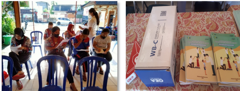
Figure 3. Pre-test on cadres

The implementation phase of this community service activity was carried out on Tuesday, May 11, 2022 at the Tegallingsah Village Hall. This community service activity was carried out 2 times, in the first activity a pre-test was carried out for cadres related to the material, then continued with cadre education about anthropometric measurement techniques. The second activity is assisting cadres in carrying out anthropometric measurements of children under five at the Posyandu as well as evaluating the results of the activities. The activity begins with conducting an initial test on cadres before providing education on anthropometric measurements at the Posyandu. Finally, the cadres are given a final test with the same questions as the initial test related to the material that has been explained. This was done to see a change in the understanding of the cadres on how to assess the nutritional status of children under five using anthropometric measurement techniques. The following is documentation during pre-test activities and the media used during cadre education (Figure 3 and 4).