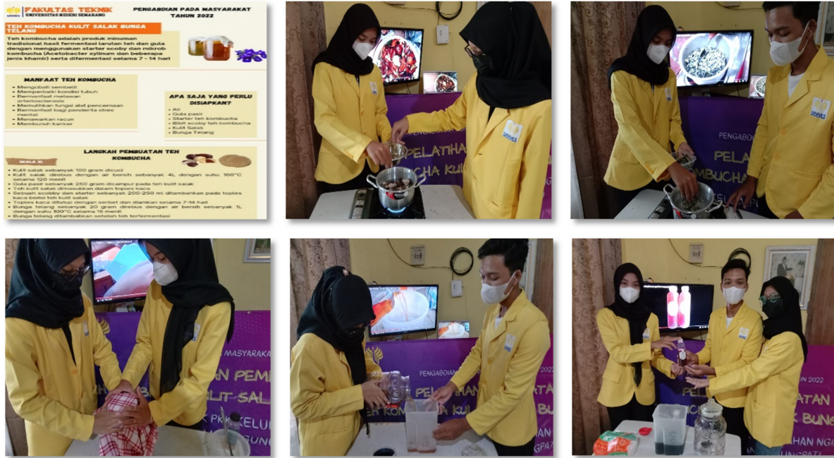
Figure 8. Explanation of the mechanism of making kombucha tea through posters and demonstration media

from the snake fruit peel and butterfly pea flower. Question and answer session were also held while community tasted the products presented in Figure 9.