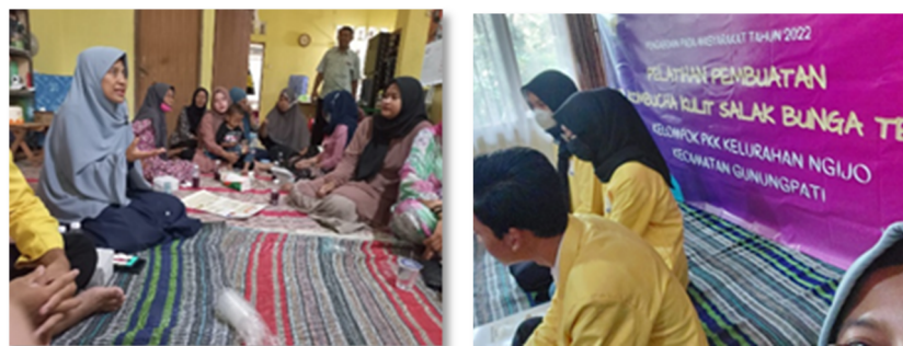
Figure 7. Team leader and students briefly describe the community service program

The team leader briefly explained the background and workings of making kombucha tea from the snake fruit peel and butterfly pea flower, while the students explained in detail including the failure factors (Figure 7).