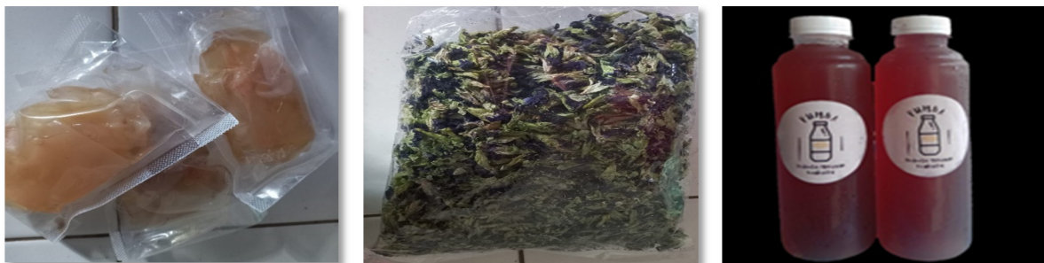
Figure 4. SCOBY and dried butterfly pea

After the fermentation process is carried out, the process of adding butterfly pea flower extract is carried out so that it becomes kombucha tea ready for consumption. Packaging and labeling are done to make it more attractive to present or sell (Figure 5).