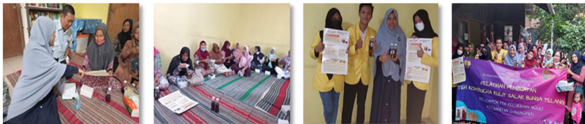
Gambar 9. Community taste kombucha tea and ask questions Figure 10. Closing service outreach

Figure 9 shows that community tasted fermented tea drinks, resulting in a moment of question and answer between community and servants. A clear and detailed explanation of the service made the community understand and satisfied. The closing of the socialization was carried out with a group photo session after the question and answer was completed which is presented in Figure 10.