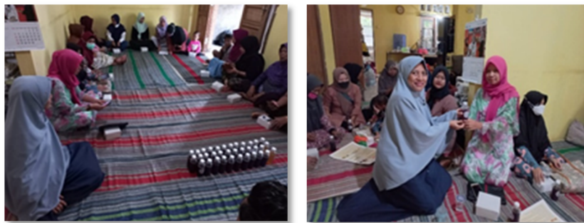
Figure 6. Socialization of kombucha tea from snake fruit peel-butterfly pea flower

The PKK group RT 3 RW 3, Kelurahan Ngjijo, Kelurahan Ngjijo has filled the interior of the house to listen to the socialization of community service (Figure 6).