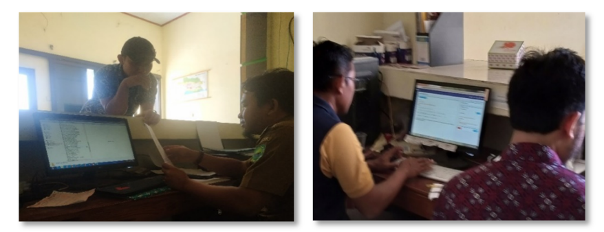
Figure 8. Manual village administration service process Figure 9. Utilizing the village administration information system

The training and mentoring process is carried out so that village officials can use the village information system, moreover to evaluate the benefits of the village information system. The process of simulating village administration services was carried out before the application (Figure 8) and after using the village administration information system application (Figure 9).