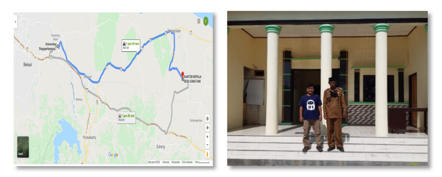
Figure 1. Location map of Sukatani Village Figure 2. Sukatani Village office

ABDIMAS: Jurnal Pengabdian Masyarakat Universitas Merdeka Malang Volume 7, No 4, November 2022: 779-788