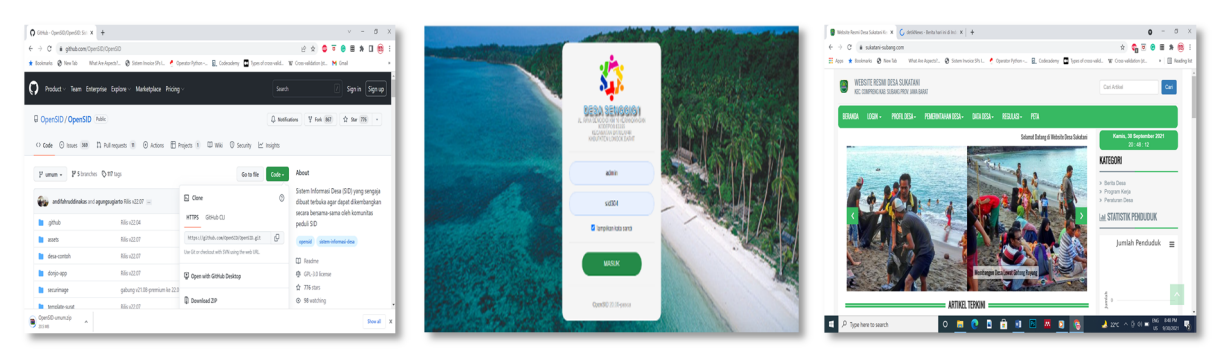
Figure 4. OpenSID download link Figure 5. OpenSID main page Figure 6. Sukatani village information system main page