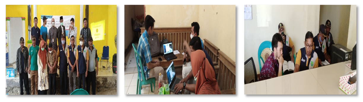
Figure 7. Training and assistance process

Furthermore, the training activity began by providing a general technical explanation of the village administration information system to the participants. This explanation is done so that the training participants can get a general explanation about the use of the application. After a general technical explanation, the participants then conduct training and assistance in using the village administration information system. Participants were divided into two groups and each group was accompanied by a trainer so that the training process could run smoothly. The process of training and mentoring in the use of village information systems can be seen in Figure 7.