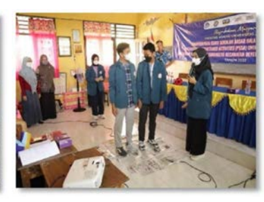
Figure 3. Demonstration and simulation Psychosocial Structured Activities (PSSA)

The second stage is the assistance of the community service team to assist elementary school teachers in carrying out Psychosocial Structured Activities (PSSA) for elementary students, including PSSA in phase 1 (safety), phase 2 (self-respect), phase 3 (personal narrative), phase 4 (adjustment), and phase 5 (future planning). The target of this PSSA in elementary school students from grades 1 to 6, led and facilitated by training participants, namely teachers. The training participants were enthusiastic when leading PSSA, and students from grades 1 to 6 were very enthusiastic, happy, and actively following the directions of the training participants' teachers (Figure 4).