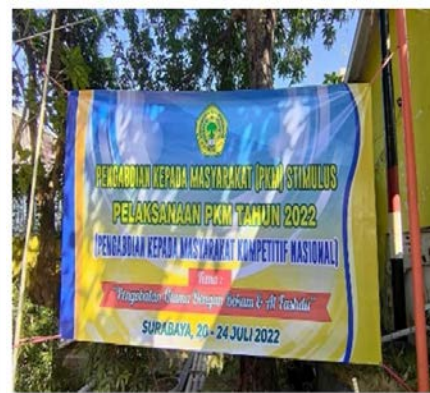
Figure 3. Property for community service program activities