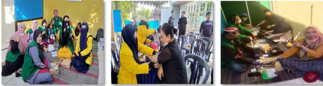
Figure 5. Therapist team Figure 6. Blood pressure measurement Figure 7. Al-Fashdu method of treatment