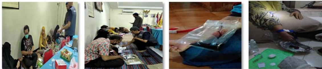
Figure 11. Al-Fashdu therapy training Figure 12. Trainees practice Al-Fashdu therapy

The next series of community service activities is to provide Al-Fashdu treatment training by the HSI therapist team, with the hope that the trainees will be able to carry out therapy independently for themselves or their families. Implementation of the training on September 2, 2022 at the Yos Soedarso University campus. Presentation of material by the HSI therapist team which contains the understanding of Al-Fashdu therapy, types of diseases that can be cured with Al-Fashdu therapy, rules before and after Al-Fashdu , how to analyze the patient's tongue, and about how to determine or look for veins. As for the patients who are prohibited from receiving Al-Fashdu therapy, namely: Hemophilia, Anemia, Hypotension, Hypoglycemia, too thin, weak, too fat so it is difficult to find the veins, Hepatitis (not recommended), and too old. Furthermore, the introduction of Al-Fashdu equipment, namely tourniquet, kidney tray, G18 syringes, 95% alcohol, plaster, and gloves. Followed by how to look for veins either on the hands or on the feet, how to install a tourniquet, how to install and inject a needle into the vein. After that all participants must be able and dare to do Al-Fashdu on themselves.