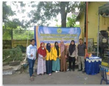
Figure 13. Group photo of the Community Service Team and Partners

Description: STD = Strongly Disagree; D = Disagree; SA= Somewhat Agree; A = Agree; STA = Strongly Agree