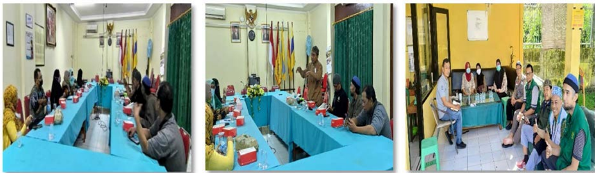
Figure 4. Al-Fashdu therapy socialization activities by the community service team

blood can come out so that new red blood production can increase; (5) Addressing medical conditions that can cause abnormalities in the blood, for example hemochromatosis and polycythemia, whereby Fashdu therapy will change the composition of the blood so that symptoms of disease conditions can be improved; (6) Balancing iron so that it does not occur such as weakness, fatigue or heart failure. This excess iron can be treated with Al-Fashdu so that it does not cause complications such as problems with the pancreas, liver and also reproduction; (7) Improving the overall health of the body due to the removal of unnecessary accumulated poisons, excess lipids and also crystals will be excreted from the body along with the blood; (8) Cleansing the lymphatics and circulation. The Fashdu method is very good for people with hypertension because Fashdu can significantly reduce blood pressure and cholesterol levels in the body; (9) Gives the spleen a chance to rest. The spleen is the main organ whose job is to filter blood so that old red blood cells can be removed.