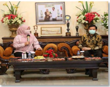
Figure 1. Advocacy process and hearings to the Regent of Pandeglang