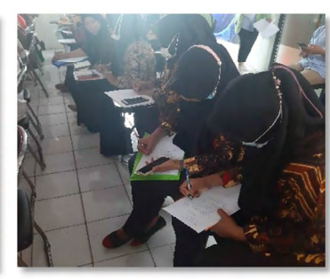
Figure 2. Counseling and implementation of pretest and post test