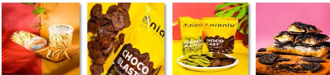
Figure 3. Results of product photos taken by the product photography community during halal certification on April 3, 2023

Handoko Sosro Hadi Wijoyo, Moh. Saiful Anam, Bagus Isyanto