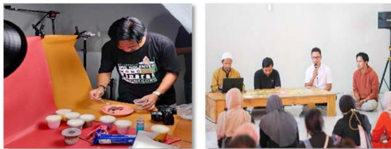
Figure 2. Document institution IAB about Halal certification assistance and process product photos involving cross product photography communities on Monday 3 April 2023