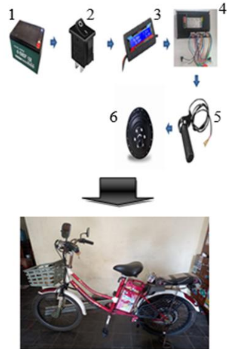
Figure 1. Series of test objects