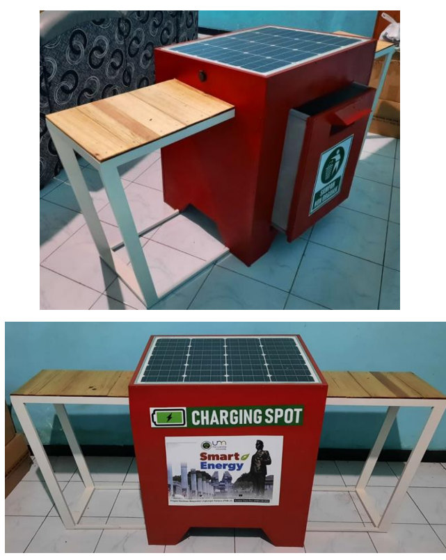
Figure 4 Solar Cell-Based Charging Spot integrated with Trash

The following are the results of the appropriate technology that has been developed.