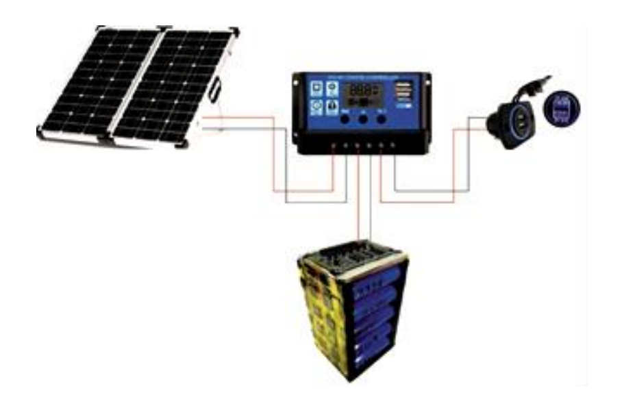
Figure 3 Solar Cell Based Spot Charging Design