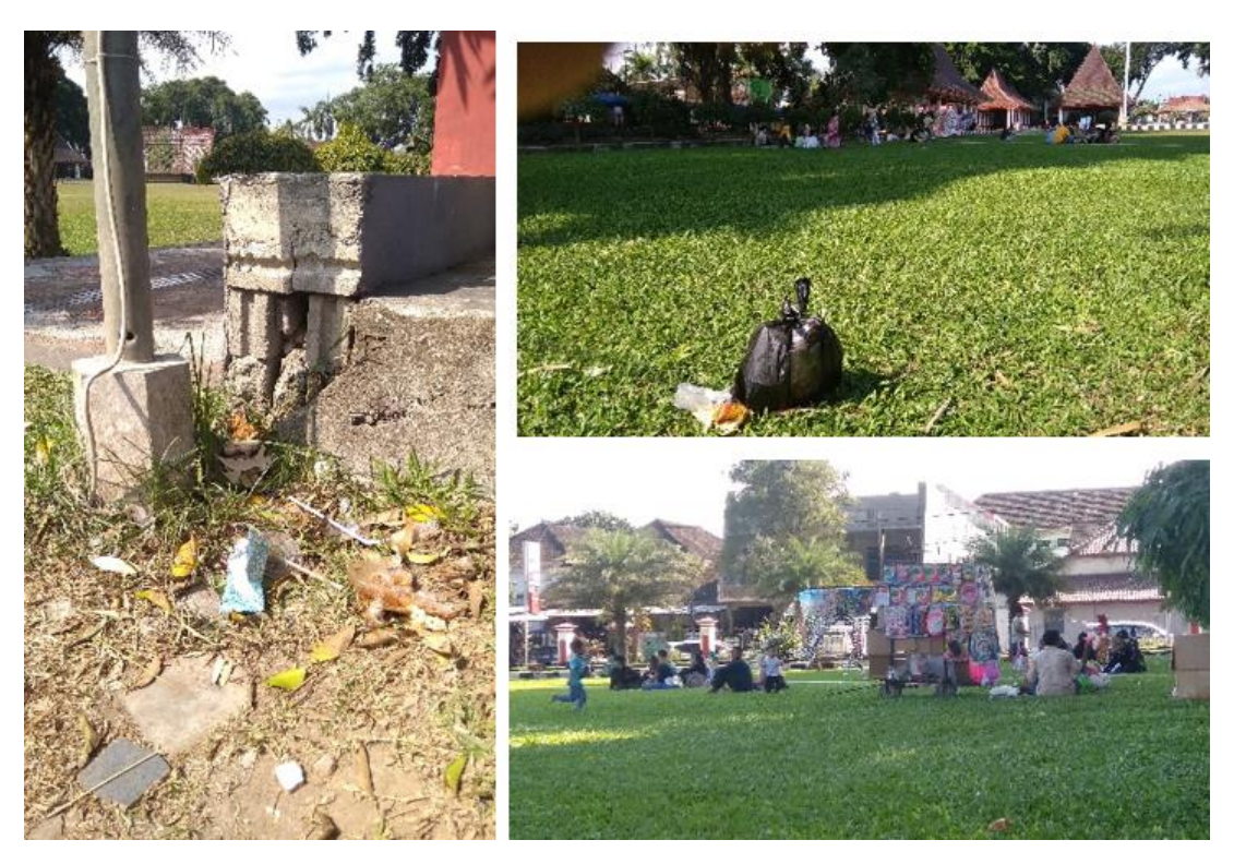
Figure 1. Cleanliness Observation Results in Aloon-Aloon Blitar City

With these various activities, it is possible that environmental cleanliness will decrease. Based on the results of observations, there is still a lot of trash found in tourist attractions or places that are most frequently visited. This is able to reduce the image of Blitar City in the national scope. Even though the City Government has a special cleaning officer, it doesn't mean that visitors throw garbage anywhere. The following is a description of what happened in the public area.