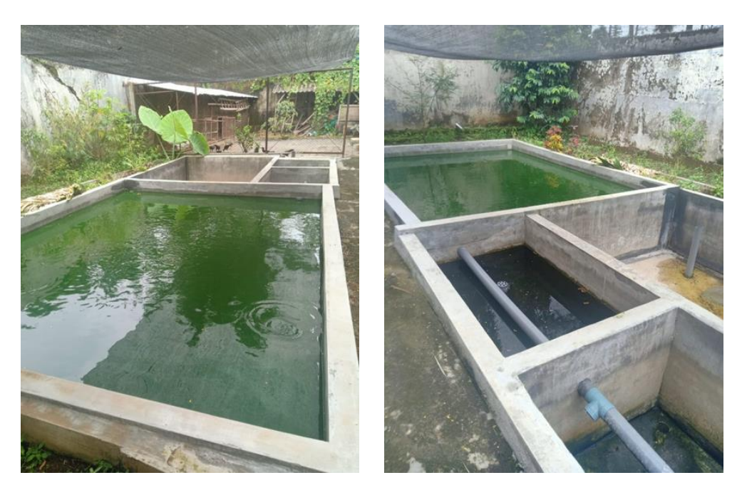
Figure 1 Freshwater Fish Ponds in the Bakalan Krajan Area

Figure 1 shows the condition of the Tilapia fish cultivation area in the Bakalan Krajan area, Sukun District, Malang Regency. From the results of these observations, problems were also found, namely regarding fish productivity that was not optimal. The causal factor of this problem is the presence of unstable or frequently changing pH levels. Agusta explained that in order to optimize yields in tilapia cultivation, special treatment is needed for this freshwater pond [7]. In addition to considering fish seeds, it is also necessary to treat the freshwater pond environment. In this case is the pH level contained in it [8-10].