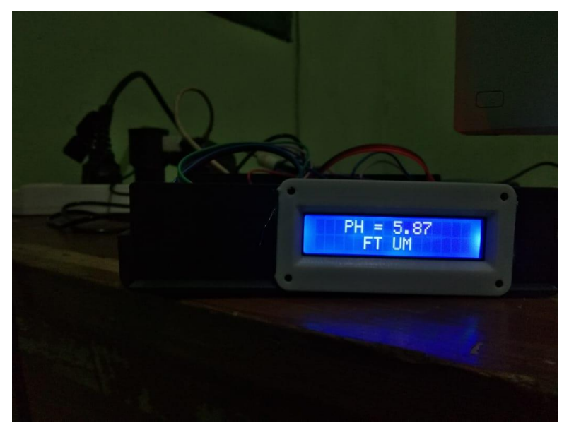
Gambar 3. Tampilan Automatic pH Controller

Based on Figure 3 it can be seen that the display contained in the appropriate technology automatic pH controller based on the Internet of Think (IoT) can display the pH value found in freshwater ponds. In accordance with the appropriate pH value for tilapia aquaculture which states that a good pH is between 6.5 to 8.5, then the value shown in Figure 4 will notify the user that his freshwater pond is in acidic conditions. At the same time this condition will also trigger the relay to become active.